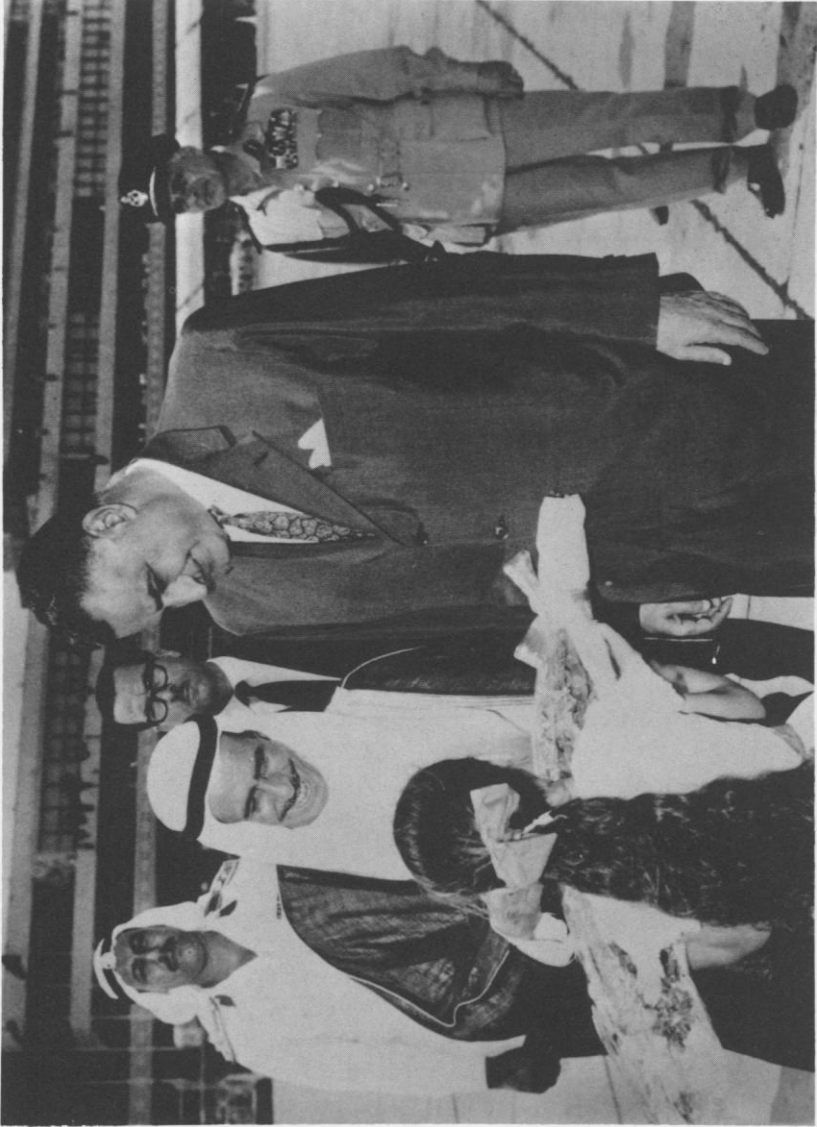
FIG. 4.— Meeting Nasser. Original found image.