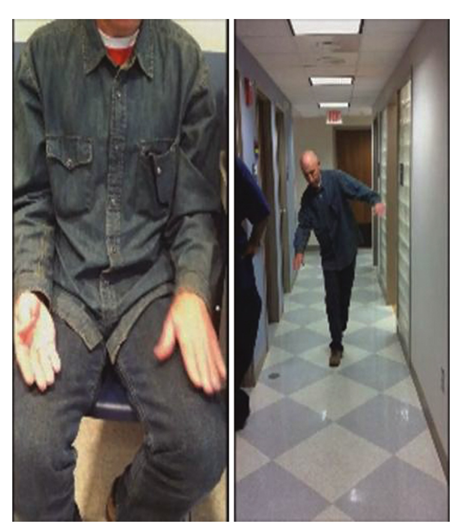
Video Segment 1. Neurological Examination at First Visit. Neurological examination demonstrates mild dysdiadochokinesia and moderately impaired tandem gait.

of health until 3 years ago, when he began to experience progressive difficulty with balance. While walking, he would find himself swaying from side to side such that he had difficulty walking in a straight line. He had difficulty climbing stairs and had several falls. He felt clumsy and also noted speech difficulties. No past medical or family history of neurological disorders was reported. His father died at 72 years of age from cancer. His mother was alive and healthy. He had five healthy siblings and a healthy 15-year-old son. On examination, his mental status and cranial nerve examination were normal, with no ocular findings. Sensory examination was normal bilaterally, and reflexes were grade 2 throughout. Motor examination revealed normal muscle power without atrophy. He had dysarthric speech, dysdiadochokinesia, mild to moderate finger-to-nose ataxia, mild heel-to-shin ataxia, and marked midline ataxia. His gait was abnormal with a wide-based stance and shortened strides. He was unable to tandem gait (Video Segment 1 and Segment 2).