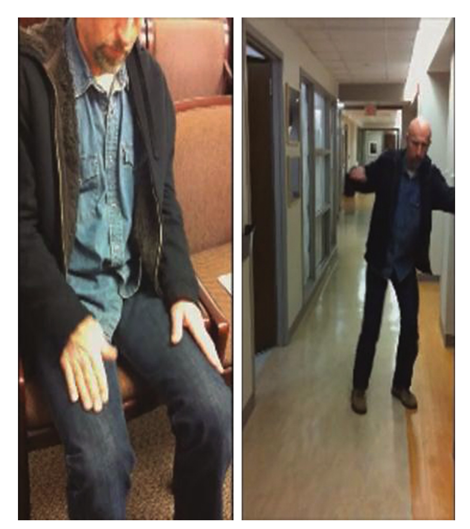
Video Segment 2. Neurological Examination at Follow-up after 6 Months. The patient has worsening neurological features with severely impaired tandem gait and severe difficulty in balancing on one foot such that he nearly falls.

0.45 \mu g/mL (reference range: 0.75–1.45 \mu g/mL). Thus, the patient was started on oral copper supplementation at 6 mg/day of elemental copper orally for a week, 4 mg/day for the second week, and 2 mg/ day thereafter. Unfortunately, the patient showed no improvement, with continued gradual decline in his gait imbalance, and his repeat serum copper remained low even on supplementation. He was subsequently admitted to the hospital on two separate occasions for intravenous copper infusions of 2 mg of elemental copper for 5 consecutive days. Again, his copper levels remained low. At multiple points over a 3-year period, he had low serum copper ranging from 0.33 to 0.45 \mu g/mL and low ceruloplasmin ranging from 12 to 15 mg/dL as noted in the Table 1.