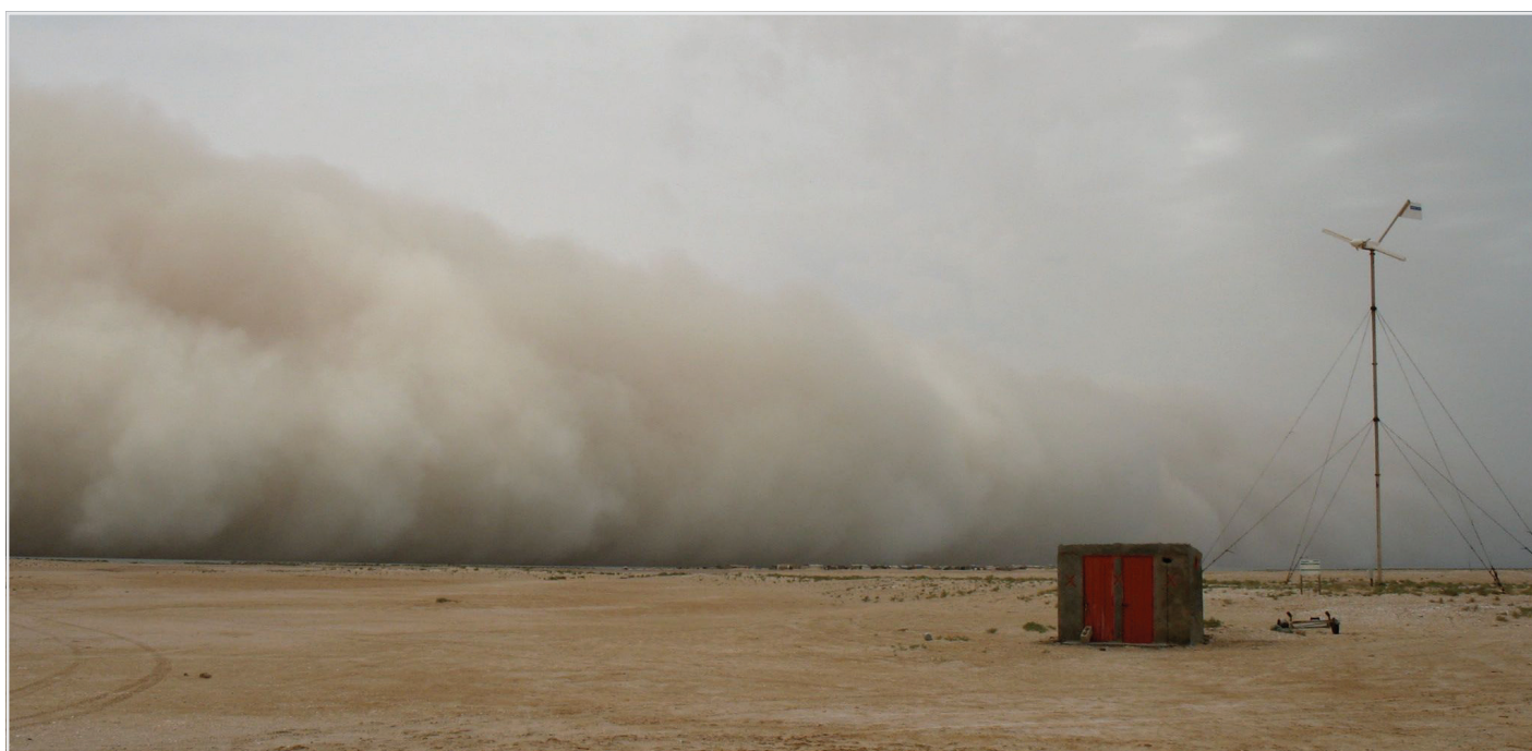
Figure 1: Dust storm in Iwik, Mauritania.

Seasonal dust fluctuations are also superimposed by longer-term variations on interannual-to-decadal timescales. Shao (p. 10) sheds light on the links between dust fluctuations and climate variability modes and trends, and presents recent regional dust modeling results for Asia and Australia. Altogether, these results emphasize the need for long-term monitoring of dust deposition. To that effect, the most striking long-term effort discussed in this issue is the dust recordings from J. Prospero's Barbados observatory. The observations now cover half a century and provide a deep insight into West African dust source variations and trans-Atlantic dust transport (Prospero p. 12). This record revealed for example a less pronounced correlation between precipitation in the Sahel region and dust deposited on Barbados than suggested previously.