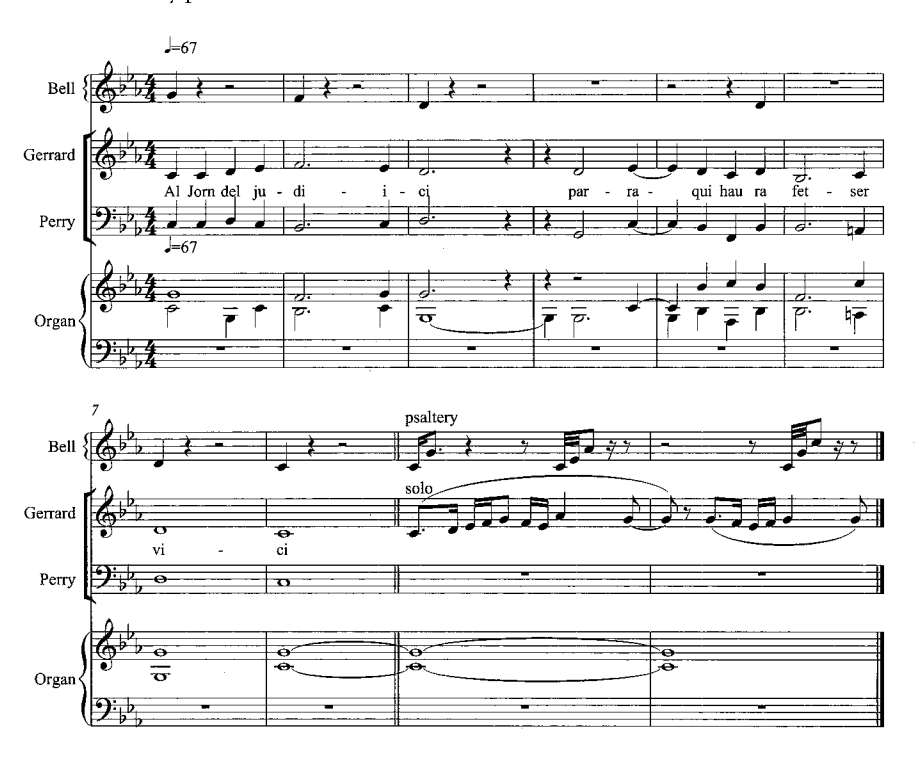
Example 1: Transcription of "The Song of the Sibyl," performed by Dead Can Dance ( Aion , 1990), refrain. Words and music by Lisa Gerrard and Brendan Perry, © 1990 Momentum Music Ltd. and Beggars Banquet Music. All rights controlled and administered by EMI Virgin Music, Inc. All rights reserved. International copyright secured. Used by permission.

of the packaging, and the emotional impact that creates an out-of-this-world experience is culturally constructed through a complex and ever-changing interweaving of musical signs. The ringing of bells, the use of organ, acoustic resonance, responsorial form, conjunct motion, and ametricism are all constituents of this particular musical discourse of medievalism that, because of their prominence in Western religious practices, have come to symbolize the spiritual.