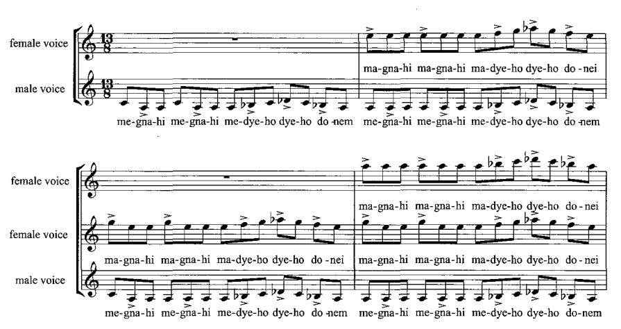
Example 5: Transcription of "Echolalia," performed by Dead Can Dance ( The Serpent's Egg , 1988), statements two, three, and four. Words and music by Lisa Gerrard and Brendan Perry, © 1988 Momentum Music Ltd. and Beggars Banquet Music. All rights controlled and administered by EMI Virgin Music, Inc. All rights reserved. International copyright secured. Used by permission.

As in other songs, the vocal layers are gradually built up, with a statement by Perry, followed by another with Gerrard at the octave. The third statement adds Gerrard a perfect fifth above, while the fourth adds her a fourth higher, at the upper octave (example 5).