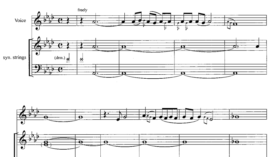
Example 4: Transcription of "Host of Seraphim," performed by Dead Can Dance ( The Serpent's Egg , 1988), fifth and sixth phrases. Words and music by Lisa Gerrard and Brendan Perry, © 1988 Momentum Music Ltd. and Beggars Banquet Music. All rights controlled and administered by EMI Virgin Music, Inc. All rights reserved. International copyright secured. Used by permission.

pharyngeal resonance of her vocality, and the ornamented melody against a drone are, again, evocative of Bulgarian music from the Pirin region (example 4). However, this setting is then juxtaposed with a "Western" vocal practice common to performances of chant: at the end of the piece, as if imagining a religious ceremonial practice, Gerrard changes her vocal quality, which has until this point used pharyngeal resonance, vibratory ornament, and glottal stops in the style of Balkan practice, to a straight tone, releasing an embellished melodic line on the syllable "a," thus conjuring up an Amen or Alleluia.