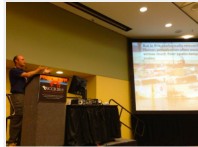
ROCKING THE MIC