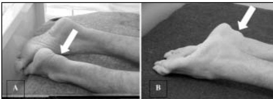
Fig 1. Achilles tendon xanthomas (arrows): case 1 (A) and case 2 (B).