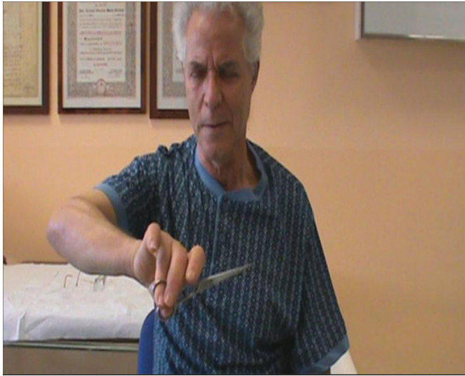
Video 1. Hair cutting dystonia. The patient exhibits extension of the second and fifth finger of the right hand, spasmodic contraction of the muscles of the hand and dystonic posture of the elbow, which slows the cutting procedure. Craniocervical dystonia is present, as well.

cutting hair, we observed extension of the second finger and fifth finger of the right hand and spasmodic contraction of the muscles of the hand. The voluntary posture of the elbow was affected by dystonic contractions and maintained with some effort, thereby inhibiting the cutting procedure (Video 1). Mirror movements emerged in the left unaffected hand during this activity. The patient did not complain of any symptoms while drawing (Video 2). Similarly, no dystonic postures or movements emerged while the patient wrote or held his arms outstretched in a fixed posture in front of his chest (video not available). A neurological examination ruled out the presence of any signs of cerebellar ataxia, akinesia, rigidity or spasticity.