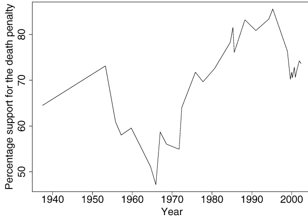
FIG. 1. The proportion of adults surveyed who answered yes in the Gallup Poll to the question, “Are you in favor of the death penalty for a person convicted of murder?” among those who expressed an opinion on the question. It would be interesting to estimate these trends in individual states.

divided by the proportion who will support the Republican; it is straightforward to move from estimating a population mean to estimating this ratio, as discussed in the context of this example by Park, Gelman and Bafumi (2004)]. We would also like to use series of national polls to estimate state-by-state time trends, for example in the support for the death penalty over the past few decades. (See Figure 1 for the national trends.)