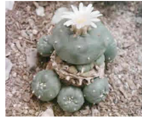
A Peyote Cactus