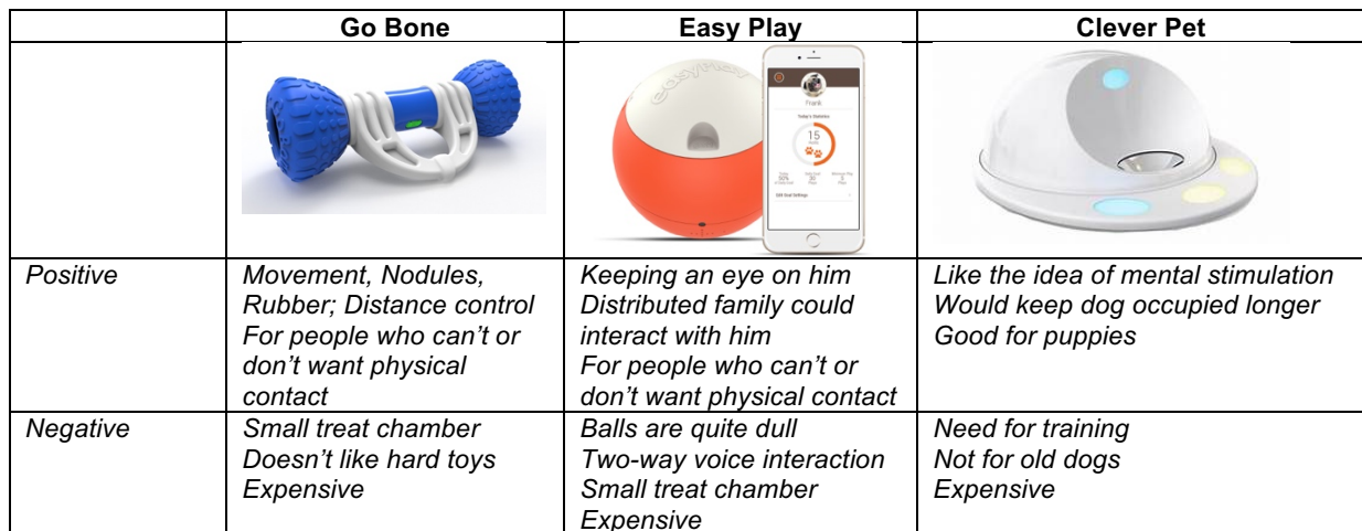
Table 2: Reactions to existing technology