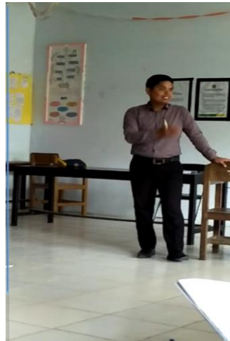
Figure 6: Lecturer lifted his right hand to make the turn taking

In a first meeting, the researcher did not only find one type of gesture. But, there was also another type of gesture occurred in the teaching process where it was happen in a three minutes and forty seconds. For more detail could be described as follow: