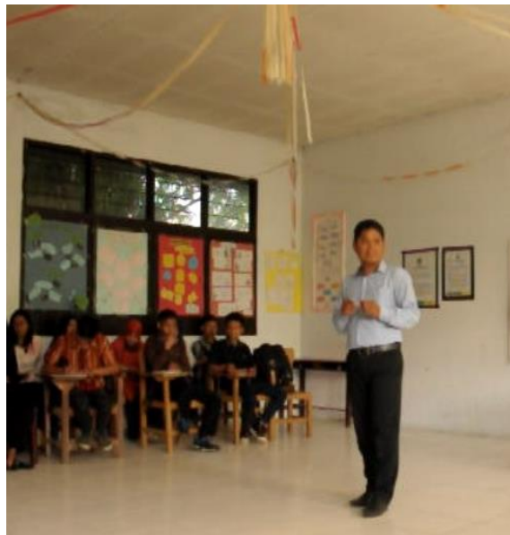
Figure 8: gesture by moving hands

As can be seen on the image above that a lecturer was waiting students to ask question. In this case, he was silent while waiting students stated their opinion about material conveyed by lecturer.