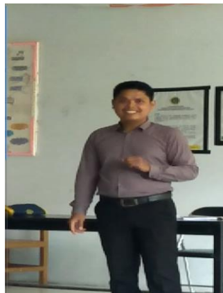
Figure 10: gesture by smiling

As can be seen on the image above that a lecturer was smiling while lift his right hand where his gesture is indicated as affect display. At that time, he said “sementara saya menjelaskan seperti ini,