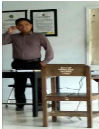
Figure 2: gesture by holding head

Another nonverbal communication of a lecture also appear in a first meeting which still talked about the same material. Then, the gesture of a lecture could be seen below: