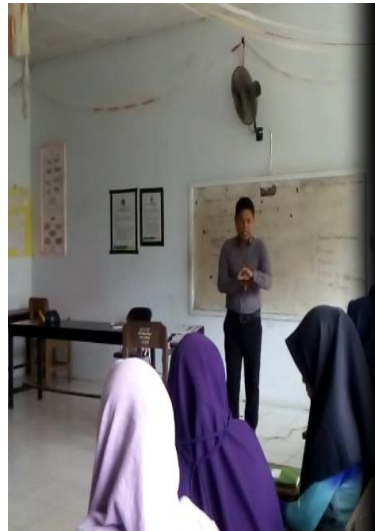
Figure 1: gesture by moving hands

The above image exhibited that a lecturer explained about the material especially about teaching strategy where in the process of his explanation, he hold his right hand while pointing at his watch. At that time, he said 'when you became teacher, then you have children, wife or husband, then there would be