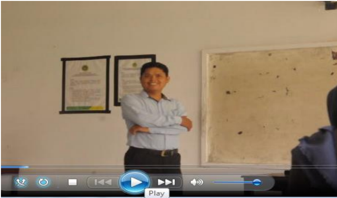
Figure 4.11 gesture by smiling

As can be seen on the image above that the lecturer displayed his smiling to his students where it was also followed by his students who showed expression of laughed at him. At that time, a lecturer open his mouth while his teeth was visible. It is indicated that a lecturer showed affect display’s gesture. Moreover, he said ‘if you search the internet there are no pictures like that (the students laughed) but you find a lot of words, then I instruct you to draw about the meaning of strategy.