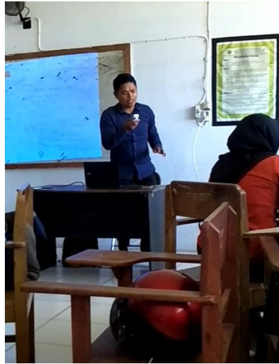
Figure 9: Lecturer took off his phone

The eighth image above exhibited that the lecturer took his handphone and stood while saying “tunggu dulu ya” . Gesture shown by a lecturer is indicated as emblem gesture in which a lecturer attempted to convey a message to a student and it is followed by his gesture. The gesture that occurred above is classified as emblems gesture in which it is in line with the theory of Ekman & Friesen (1969). In this case, Emblems are nonverbal behaviors that can be translated into words and that are used intentionally to transmit a message.