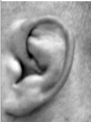
Figure 2. ECG on admission