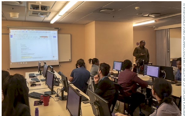
Technology enhanced teaching and learning at the University of Cape Town. SOUTH AFRICA

Being digitally capable is an ongoing process of development and change over time and across different contexts. For example, we may be competent at communicating with our friends on our mobile phone but less capable when participating in an e-learning course. Developing our digital capabilities can help us to save time and be more effective as teachers and learners. It can also help us to prepare for the future in a fast-changing technological world.