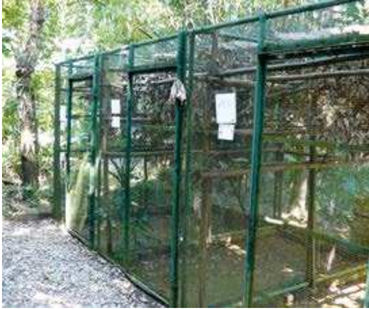
Fig.2. Outdoor enclosures for lorises at the Endangered Primate Rescue Center.

substantially, from less than 12 hours to over 24 hours (Fig. 4). The longest torpor bout recorded was 62.6 hours. This might seem relatively short, but it is longer than the maximum bout duration in four other hibernating species (including one lemur, Table 1), and comparable to the median maximum torpor bout duration in mammals, which is only 4.8 days (Ruf & Geiser, 2015). The occurrence of multiday torpor bouts, the fact that minimum body temperatures closely resembled ambient temperatures, and the weight gain and accumulation of adipose tissue prior to the cold season all identify pygmy lorises as seasonal hibernators (Ruf & Geiser, 2015).