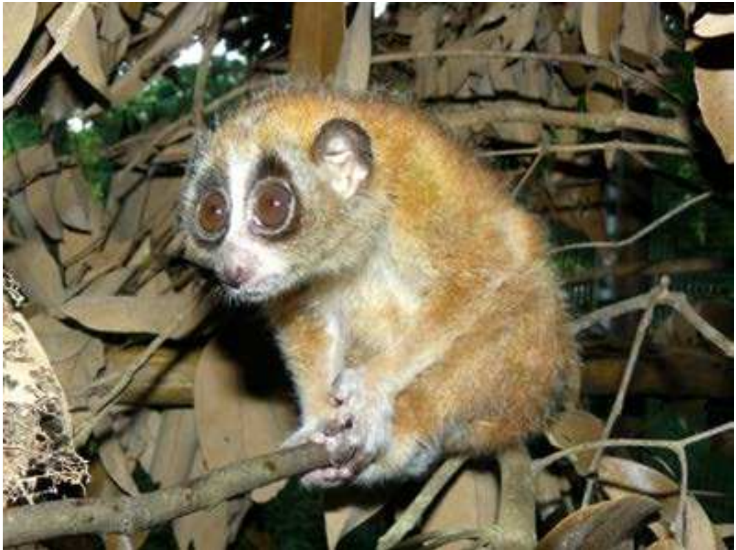
Fig.1. Pygmy loris ( Nycticebus pygmaeus ) at the Endangered Primate Rescue Center.

Pygmy lorises are members of the same suborder as lemurs, and have a small body with a weight rarely exceeding 400 g, which accounts for a high rate of heat loss (Fig. 1). They live partly in habitats with distinct seasonal fluctuations in ambient temperatures and food availability. Both body size and the seasonality of their habitats have previously given cause to assume that lorises might use torpor, and anecdotal evidence suggested that pygmy lorises undergo bouts of torpor during the cold season (Ratajszczak, 1998; Streicher, 2004).