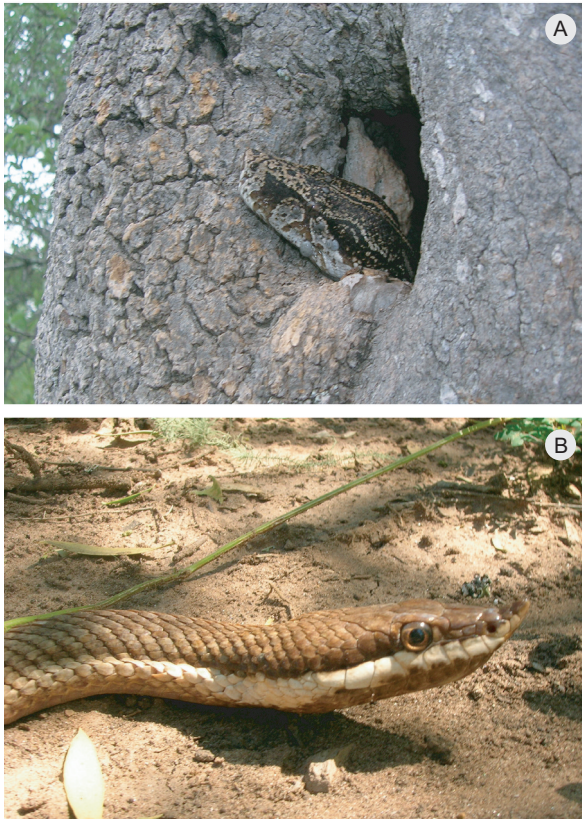
Figure 3. (A) Boa Constrictor Boa constrictor occidentalis visiting an active Blue-fronted Parrot nest cavity. (B) A Baron's Green Racer Philodryas baroni that was removed from a Blue-fronted Parrot nest cavity after partially ingesting a nestling.

one young. The number of surviving nests declined at a higher rate during incubation and the first days after hatching than during the rest of nestling period (Figure 2). Hazard rates were higher during the first days of the nestling stage.