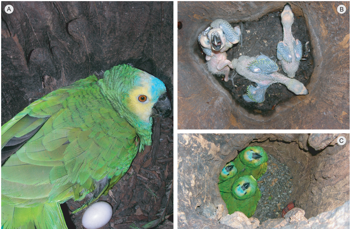
Figure 1. (A) Incubating female Blue-fronted Parrot inside a tree cavity. (B) Brood of four nestlings between 26 and 32 days after hatching and (C) a brood of three nestlings just a few days before leaving the nest. Nestlings fledge on average when they are 58 days old.

We also took the following measurements of the nest entrance hole: height from the ground, minimum and maximum diameter, and inclination. We measured inclination as the angle between an axis perpendicular to the entrance hole area and the vertical line to the ground (see Berkunsky & Reboreda 2009). A value of 90^\circ corresponded to an entrance hole with an axis perpendicular to the vertical plane. Smaller and greater values corresponded to holes that were oriented down or up, respectively. We assigned entrance hole inclination values to one of five categories: -2 = 0^\circ\text{--}22^\circ (facing down), -1 = 23^\circ\text{--}67^\circ , 0 = 68^\circ\text{--}112^\circ , 1 = 113^\circ\text{--}157^\circ , and 2 = 158^\circ\text{--}180^\circ (facing up).