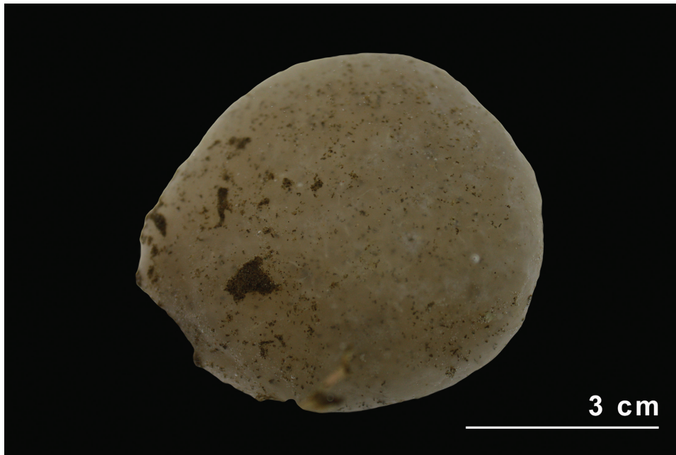
Figure 2. Colony of Synoicum molle photographed in vivo.