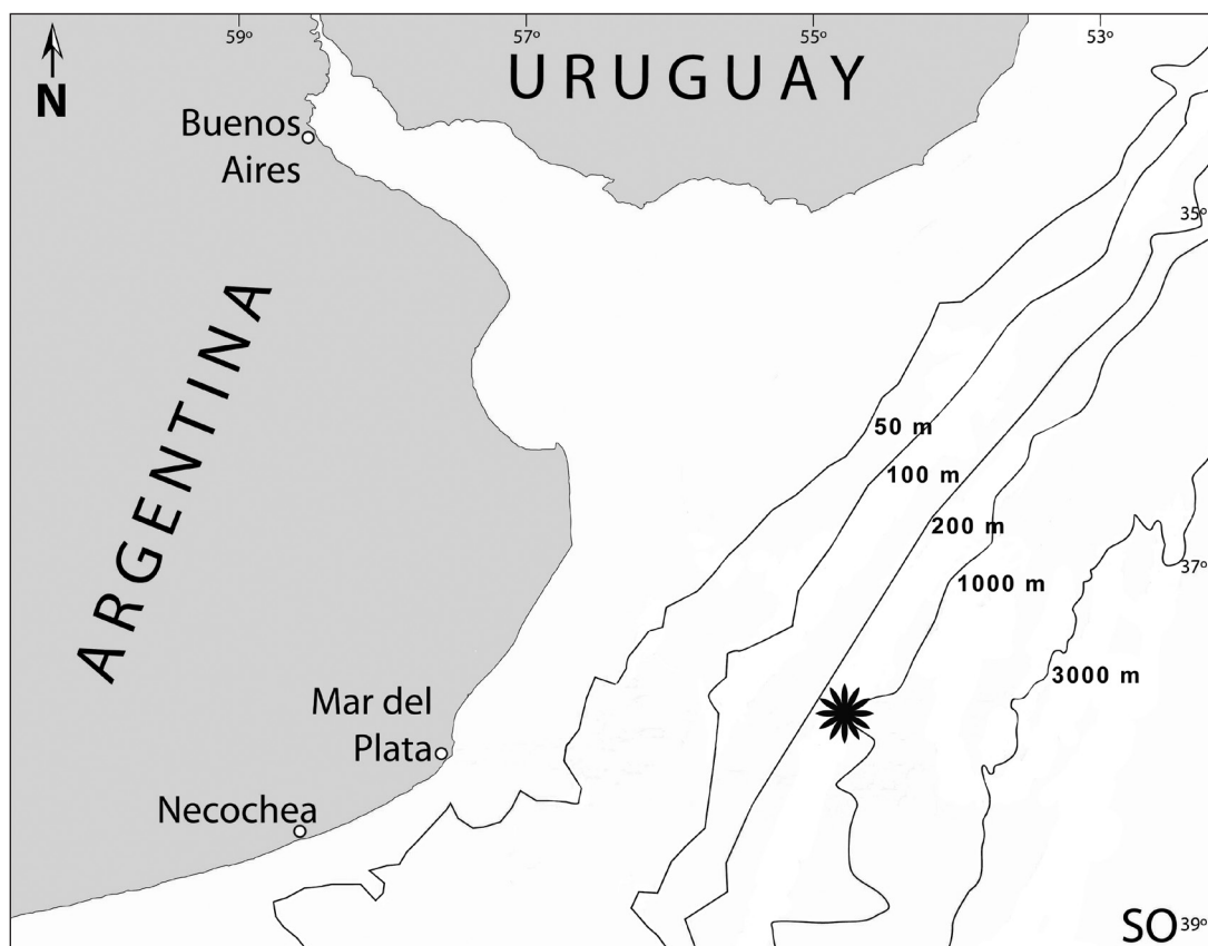
Figure 1. Study area in the SW Atlantic. The asterisk shows the sampling location.

Description. The colonies are almost identical in shape: globular, nearly spherical (Fig. 2). The biggest colony measures 9.1 cm in diameter by 3.2 cm in height, while the smallest one reaches 2.5 cm in diameter. The tunic is grayish with variation in intensity, the smallest colonies being the darkest. The zooids, when alive, are white. When fixed in formalin, they turn pale yellow. The test is soft and free of foreign material. Only in two small specimens, some grains of sand and a few epibiotic foraminifera were detected. The tunic is consistent and rigid. The zooids, in variable numbers, are arranged in irregular rosette-like systems around common, although not visible to the naked eye, cloacal apertures. One colony shows zooids with no arrangement at all in the uppermost area,