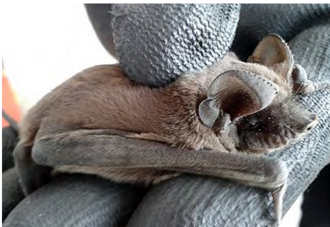
Figure 3. Dorso-lateral view of the adult male of Tadarida brasiliensis from Puerto Deseado, Santa Cruz, Argentina.

At the laboratory of the Centro de Investigaciones de Puerto Deseado (UNPA-UACO) the specimen was weighed, sexed, and measured; later it was released during the evening. The specimen was considered an adult since it did not have cartilage streaks in the metacarpalia and phalanx articulations (Anthony 1988).