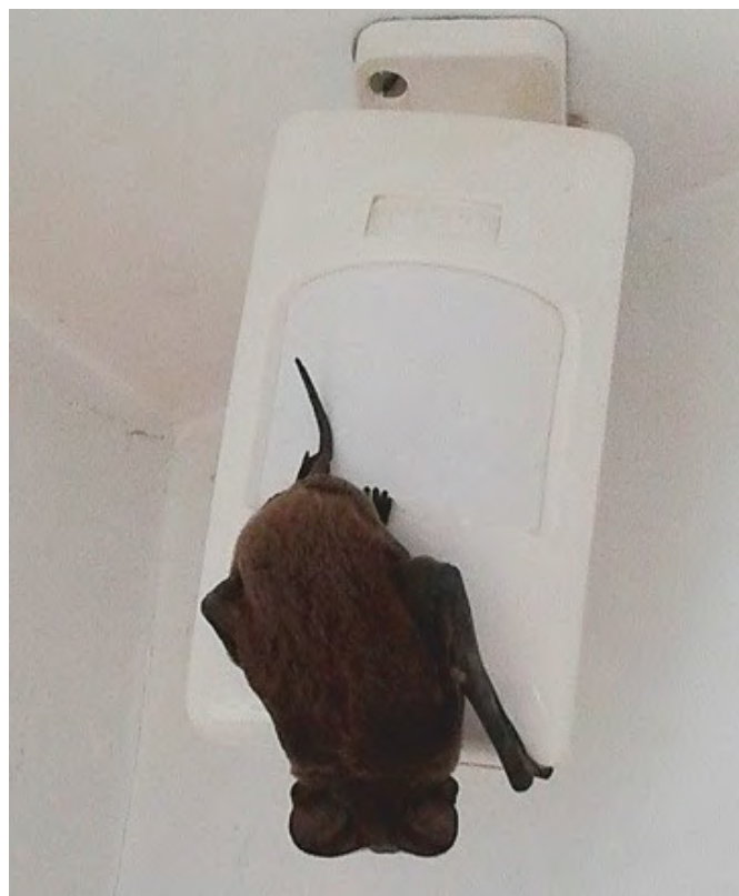
Figure 1. Adult male Tadarida brasiliensis found hanging from an alarm sensor inside a house in Puerto Deseado, southern Patagonia.

A living adult male specimen of T. brasiliensis was found on 31 March 2015 hanging from the alarm sensor inside the livingroom of a house in the city of Puerto Deseado, located on the Atlantic coast (47°45’15” S, 065°54’01” W) (Figures 1 and 2). The area belongs to the Patagonian Phytogeographical Province ( sensu León et al. 1998). It is a flat steppe of shrubs and grass interrupted by ravines, dominant tussock grass species are