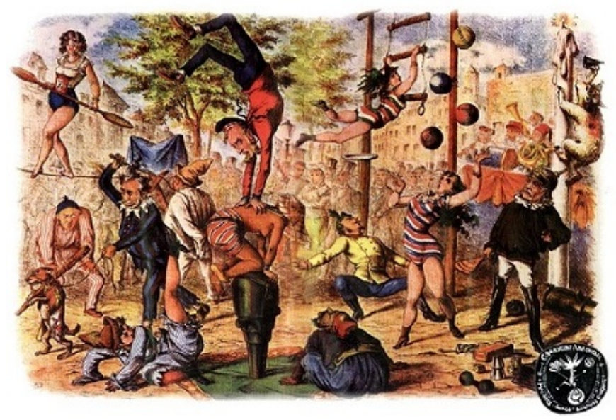
Figure 4. Drawing used in the "Convención Argentina de Circo, Payasos y Espectáculos Callejeros," linking the actual practice to the tradition of popular arts in the public square.

The early years of the 1990s saw the genesis of several styles or methods of doing circus: New Circus, <sup>27</sup> Street Circus, and Social Circus. There is a general consensus that Gerardo Hochman is an important local reference for the development of New Circus in Argentina. In the early 1990s he joined a group of artists that were already developing circus languages in Buenos Aires and created La Trup. After a considerable amount of training and experimentation, they released Emociones simples , the first Argentinean circus performance developed in a theatre with a troupe composed of artists who had learned circus techniques outside of family circus traditions. This event was an important precedent for the development of the New Circus style in Buenos Aires, alongside the opening of La Arena School in 1994, also directed by Hochman. However, during these years there was also a strong presence of what I have called Street Circus. It is a local way of doing circus characterised by the recovery of popular performance traditions dating back to the minstrels, the travelling comedians, and the fair and carnival artists. The use of these kinds of artistic languages, considered "popular" in the Bakhtinian sense, refers to those traditions.<sup>28</sup>