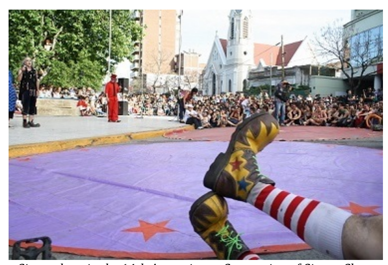
Figure 7. Street Circus show in the 14th Argentinean Convention of Circus, Clown and Street arts, 2010.

Another milestone for circus in the period occurred in 1996 when the clown Chacovachi, together with several artists recognised by this time as renovators of the circus genre, organised the first Argentinean Circus Convention. Conducted annually since 1996 up to the present, these meetings, involve a camp of 4-6 days duration with over 1000 circus artists from around the country and the world. The significance of these occasions has been analysed in other articles,<sup>32</sup> but it is essential to mention here that they developed as a very important teaching space, and a place where experimentation, knowledge sharing, and gathering together helped to develop the circus arts.<sup>33</sup>