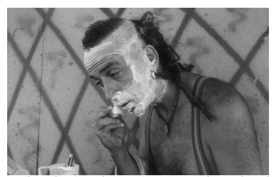
Figure 2. Payaso Chacovachi in CircoVachi, Summer Season, San Bernardo, 2003.

New performance groups recovered circus as well as other local traditions and presented them in the public space, aiming to perform popular entertainment in the context of freedom in opposition to the previous period of dictatorship. To recover the style and scenic language of old Circo Criollo and pieces such as Juan Moreira , meant to denounce in the public square the atrocities committed in the recent past of state terrorism. To occupy public space, therefore, meant exercising freedoms of which citizens had been deprived.