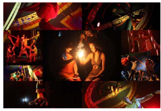
Figure 8. Three images from the early community art workshops of Circo Social del Sur from the mid-1990s to the premiere of Salto, a show performed by graduates of the organisation in 2011.

It is no coincidence that strategies for social transformation through Social Circus emerged almost simultaneously during the 1990s in different Latin American countries. <sup>36</sup> It was the neoliberal decade par excellence, it was the post 'Washington Consensus' period in which various international agencies were meeting the need to reduce state functions, transferring state obligations to the private sector or to civil society. Moreover, it was the decade that socially punished the most neglected sectors, such as the younger generations. We can think on the causes of the emergence of this kind of arts transformation by returning to Williams' notion of hegemony as a process which must be continually renewed, recreated, defended and modified, but which is also continually resisted, limited, altered and challenged. <sup>37</sup> "It was a time when you faced so much inequality that you felt something had to be done. And I had my stilts and my traps. So I started my first workshops wanting to change something from what I knew," remembers Mariana Rúfolo of her beginnings in Social Circus practice.