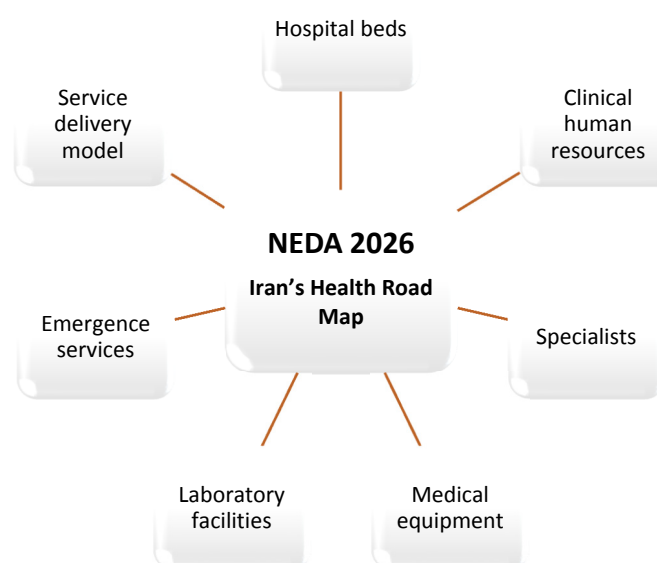
Fig. 1. Iran's National Health Roadmap Components

and economically viable expansion of hospital beds is the first step in the decision-making process to expand other expensive resources of the health system (5).