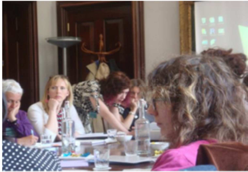
(Workshop on Gender and Local Ownership, Carlton House, June 2013)