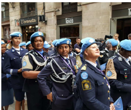
(UNPOL female officers, Parade during the Training Conference in Barcelona, October 2016)