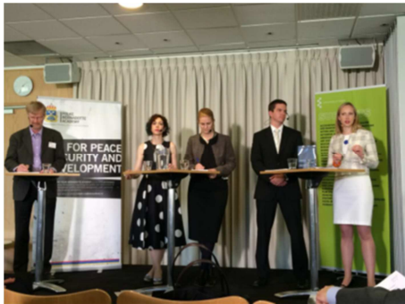
(Research for Peace, Folke Bernadotte Academy, Stockholm June 2015,)