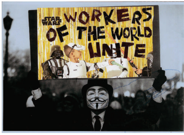
Figure 4. One of the flyers produced during the exhibition (2017). Creator unknown.

things together in an artistic frame. In his writing, Richard explores moments of political revolt as doing the work of philosophy, as being a philosophical analysis in and of itself. I take a similar approach, but in a different direction. Instead, I'm exploring moments of revolt through particular forms of artistic and cultural production, and working to tease out their meaning, their sparking.