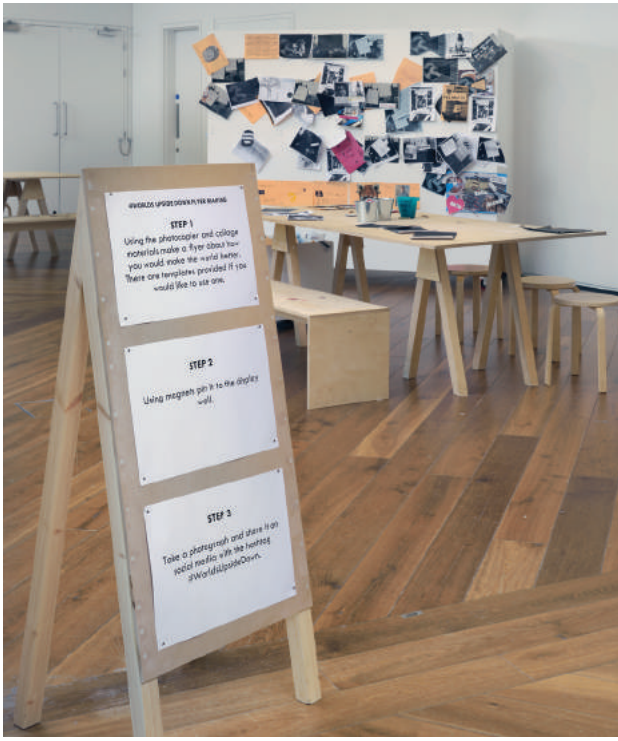
Figure 3. Photograph of the flyer-making station for the exhibition (2017).

which is quite skeptical of the notion of art itself. So, we could go back to ready-mades, to Duchamp taking a urinal and writing “R. Mutt” on it. 8 What happens when you do that? I’m interested in those kinds of gestures that radically reshape the collective practices of all kinds, from looking to making, and then often the art world itself.