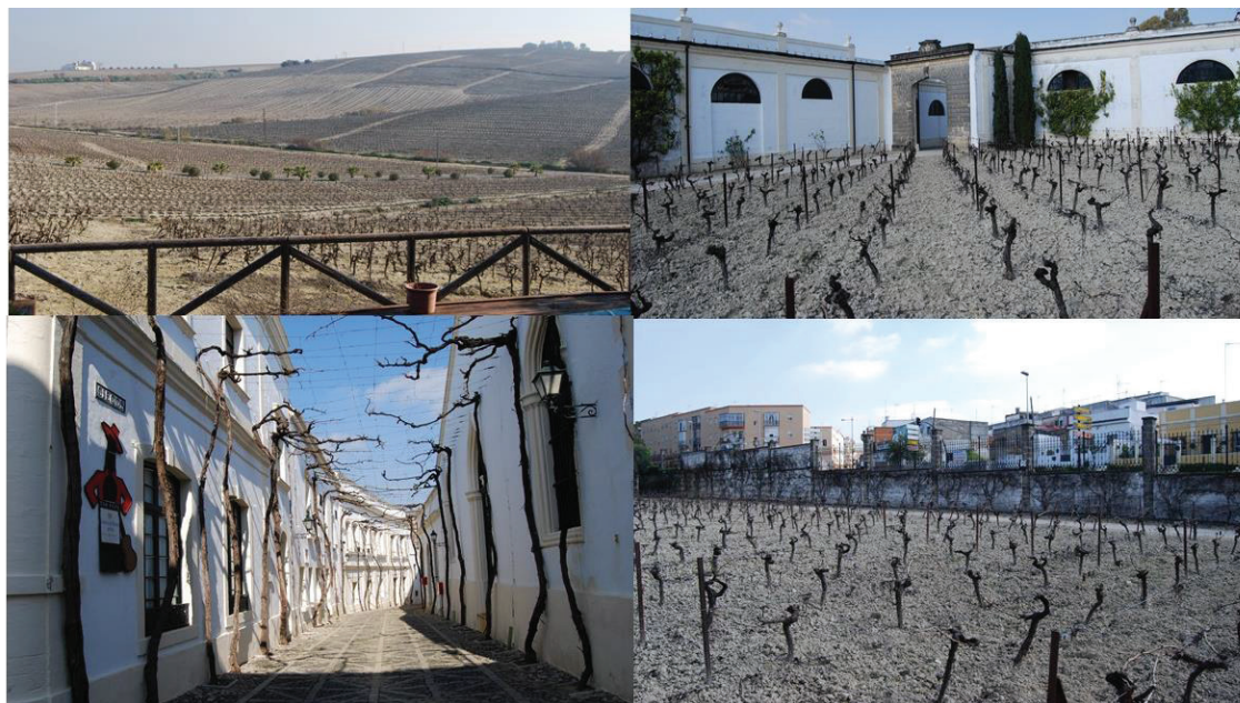
Figure 5. View of the vineyard landscape and Gonzalez Byass Winery in the Sherry Wine Region.

new varieties of grape were introduced that allowed for replanting. Historically, the height of production was reached in 1972, and this would lead to an overextended industry. From the nineteen-eighties onwards, the international crisis meant a reduction in exports, thus enforcing a period of adjustment that has lasted to the present day and resulted in the uprooting of vineyards.