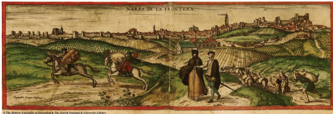
Figure 4. View of Xeres de la Frontera made between 1563 and 1567 by Franz Hogenberg. The view of Xeres de la Frontera made between 1563 and 1567 is the work of Franz Hogenberg, which is part of Civitates Orbis Terrarum. The drawing presents images of everyday life and the physiognomy of the city in the sixteenth century.