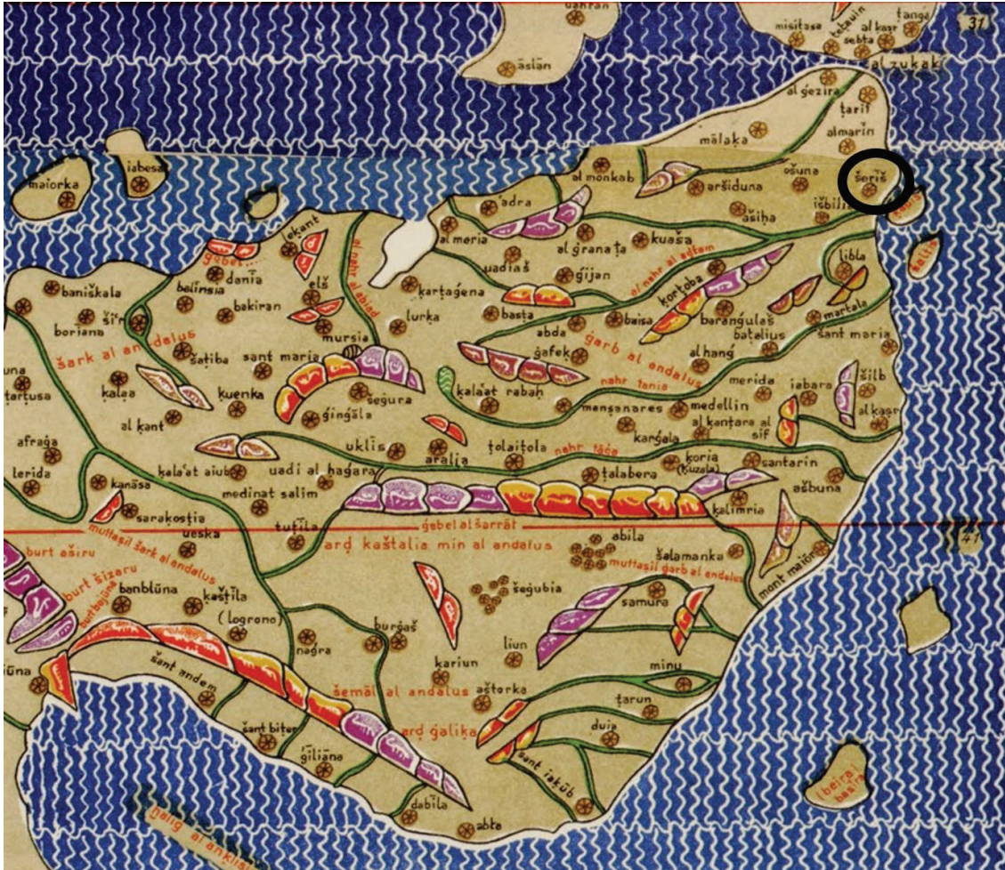
Figure 3. Šeri in the world map of Al-Idrisi (1150). A map world dating from 1150, designed by the Moorish geographer Al-Idrisi, appears the city of Šeris, the name given to the city of Jerez de la Frontera by the Moors. A curious feature of the map is that the North is at the foot of the page and the South at the top. This document describes „Xerez is a strong city, of medium extension, surrounded by walls, its surroundings are pleasant, because it is surrounded by vineyards, olive groves and fig trees.”