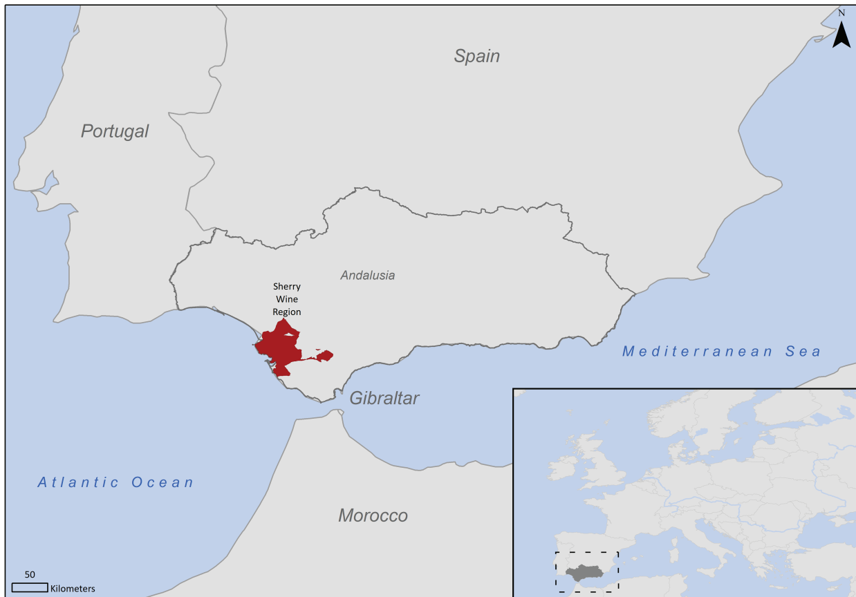
Figure 2. Study area: Sherry Wine Region (Spain).

Distribution Book ( Libro del Repartimiento ), which paints a vivid picture of the landscape in medieval times, and allows for a deeper understanding of landscape transformations; 2) a map from the digital library of the Royal Academy of Spanish History ( Real Academia de la Historia Española ); and 3) material from media sources, especially local and regional sources.