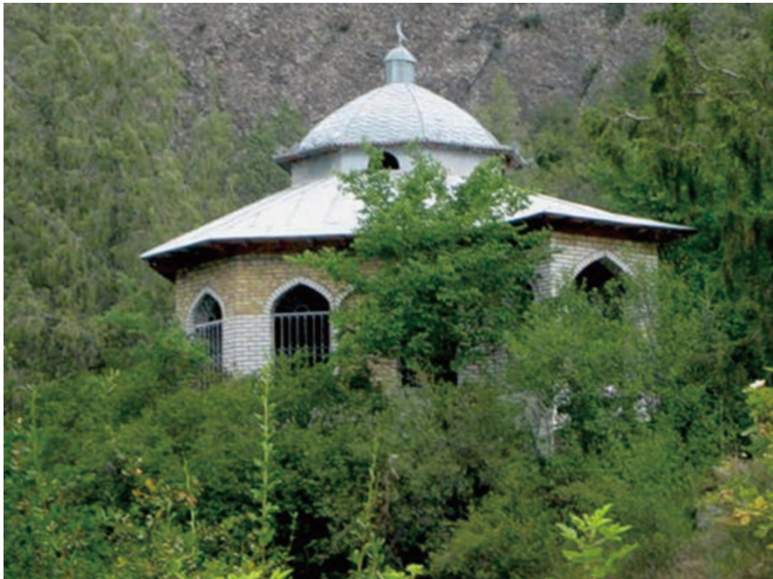
Figure 2. Padysha-Ata one of sacral Muslim place of WTS WHS

Clans defended their territories in Kyrgyzstan, particularly in the Western Tien-Shan. Conflicts over the land arose quite often among the clans. Depending on the level of social organization, land was distributed among the local population. For