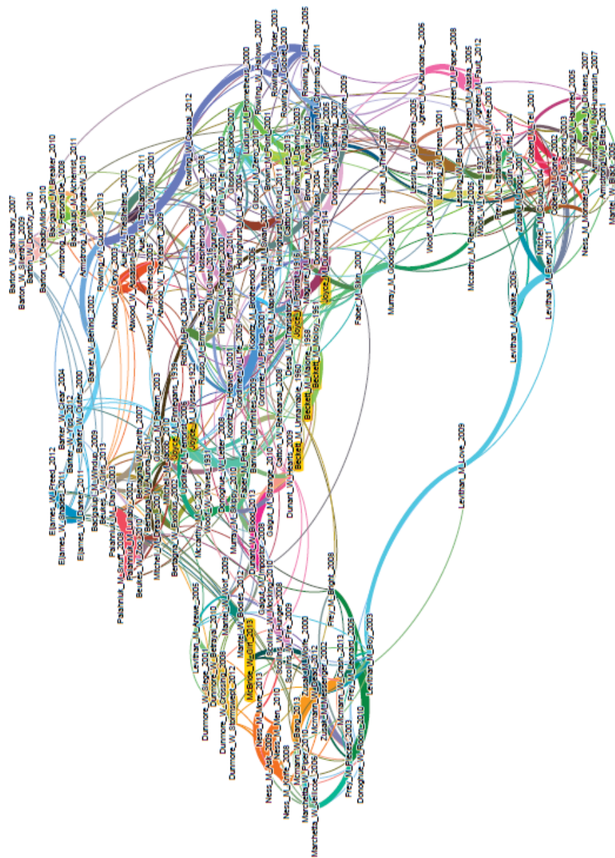
Figure 3. Big network of 20th and 21st c. novelists. POS 4-grams Source: courtesy of Jan Rybicki. McBride is in the centre of the cluster on the left.