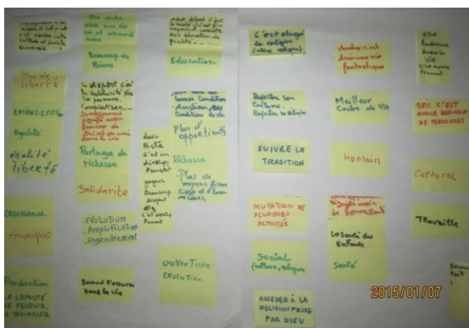
Figure 2: Participants' definitions of development produced during a participatory workshop exercise

What is less questionable is that current modernization processes are not equivalent to secularisation. If there was one recurrent element in my conversations, this was the adherence of the interlocutor—young or old, literate or illiterate, female or male—to their faith. During the participatory workshop, in an exercise in which participants were asked to define development, respect for religion were combined with concepts of freedom and improved economic wellbeing (Figure 2). Although