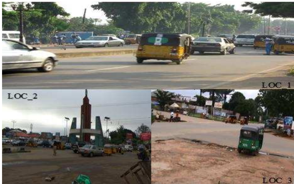
Figure 1: Study locations