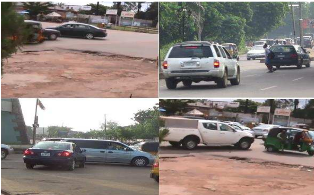
Figure 4: Examples of observed conflicts

LOC_3 is quite different from the others both in layout, traffic enforcement and regulation. With 10.8 conflicts being observed at this location every hour, 62% were serious, split evenly across peak and off peak times. Almost 90% of these were either vehicle-vehicle or vehicle-tricycle conflicts; five actual collisions took place. Considering lower traffic volume at this location, it could be considered as being more risky than the other locations, especially for vulnerable road users. Unlike the other previously discussed locations, more conflicts involving vehicle-pedestrian, vehicle-tricycle and tricycle-tricycle were observed during the off peak period. The majority of conflicts recorded during both the peak and off peak periods were crossing conflicts. A high number of opposing conflicts were also observed here unlike the other locations. Figure 4 shows examples of some observed conflicts.