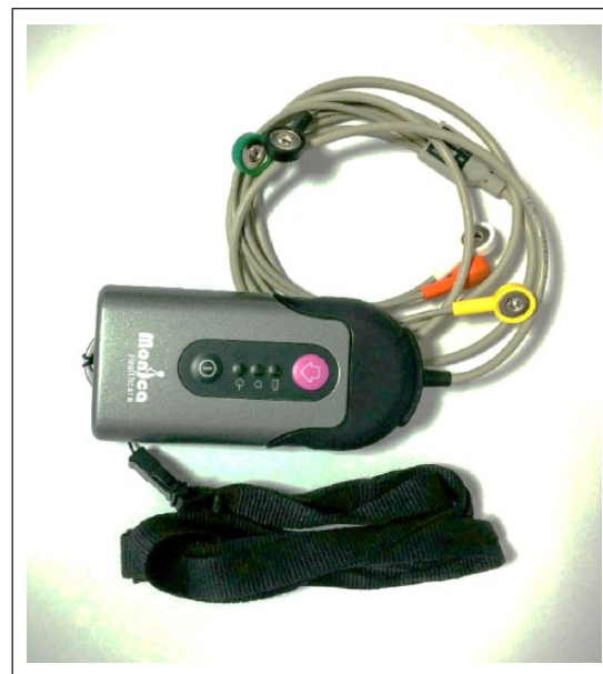
Figure 1. Monica AN24 device.

Informed written consent was obtained, and the fetal ECG monitor (Monica AN24; see Figure 1) was fitted by placing five skin electrodes in a standardized position on the maternal abdomen. 10 When fully charged, the device is capable of obtaining recordings lasting up to 20h. 18 Participants were allowed to go home and carry on with