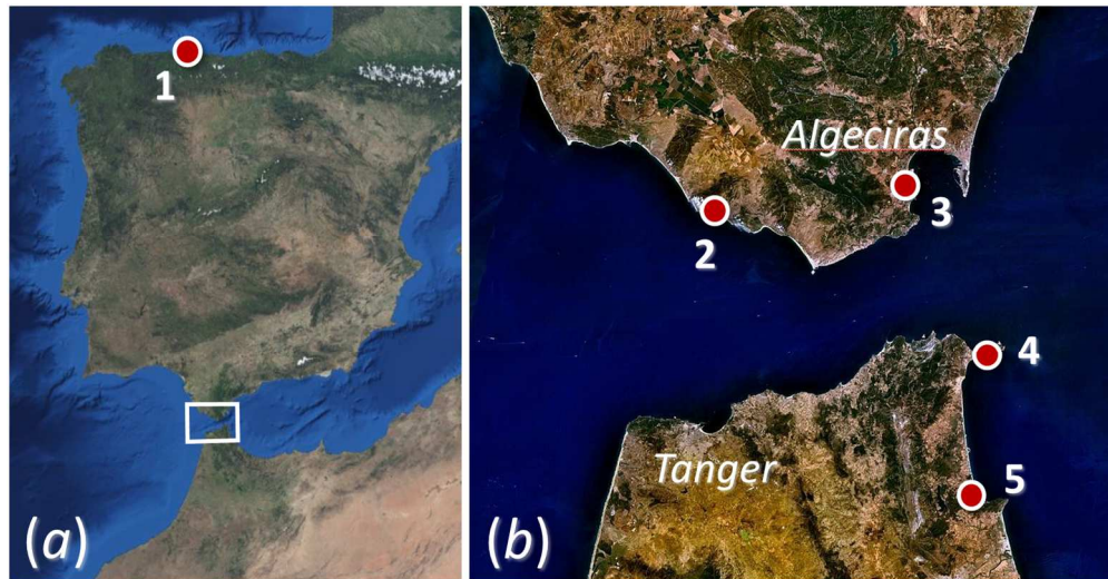
Figure 2. Location of the archaeological sites referred to in this study. Panel (a) shows the location of La Campa de Torres, Asturias (1), and the general location of panel (b) (box). Panel (b) shows the location of the four archaeological sites in the Strait of Gibraltar: (2) Baelo Claudia, Tarifa; (3) Iulia Traducta, Algeciras; (4) Septem, Ceuta; and (5) Tamuda, Tetouan. Satellite images from NASA World Wind (open source).