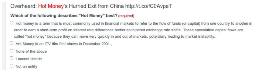
Figure 2: Classification Interface: Sense Disambiguation Example