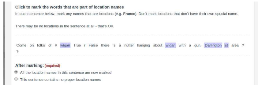
Figure 3: Sequential Selection Interface: Named Entity Recognition Example