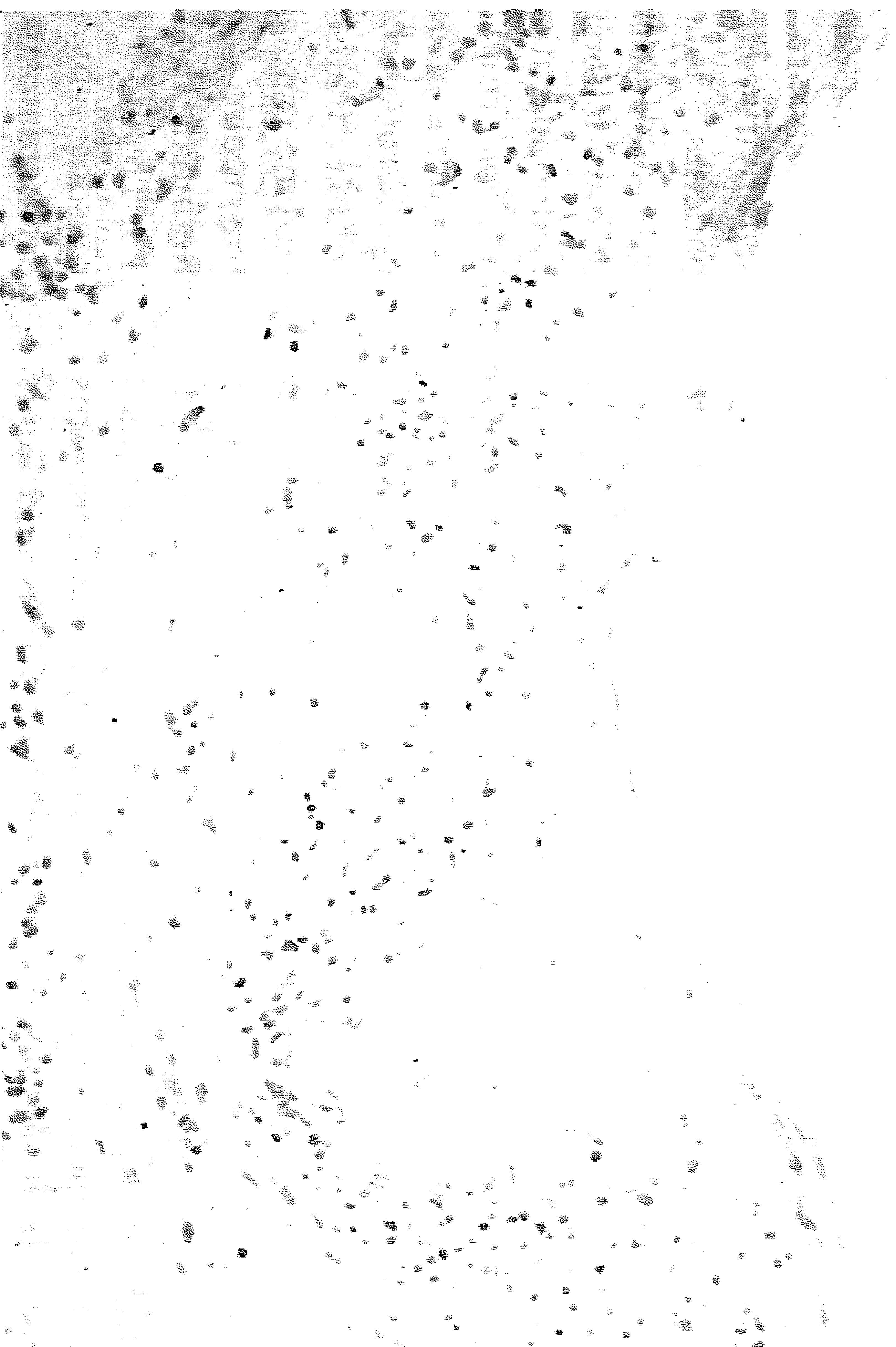
Figure 2. Histological picture of the lesions on the back (periodic acid Schiff reaction: \times 200 ).

erythematosus. Both lichen planus and discoid lupus erythematosus can occur in the same patient. 1-5 One explanation is that the patient may originally have had lupus erythematosus but subsequently also developed lichen planus because of a Koebner phenomenon. However, the distribution of the lesions is not typical for lupus erythematosus (i.e. it is not in sun-exposed sites), and other mechanisms may be involved. Both