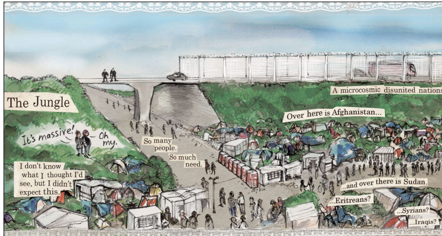
Figure 1: Excerpt from Evans, Kate (2017) Threads: From the Refugee Crisis (London & New York: Verso) © Kate Evans.

is recognisably human. With film, you have to alter someone's voice or black out the face which depersonalises the story teller. With comics, you can simply select another face and draw them differently.