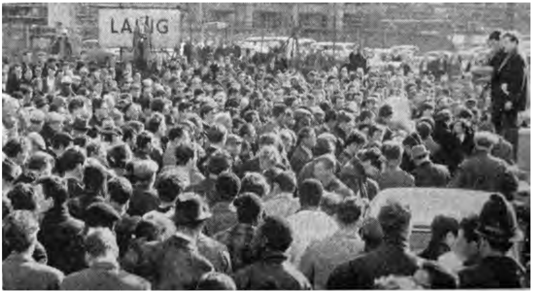
Mass meeting at Barbican, following police violence of previous day.

The strike leaders attempted to struggle on and called a protest march for 2 November, which was the day that the 24 pickets who had been arrested were due to appear in court. However, this would prove to be something of an anti-climax. Around 500 workers and supporters turned up, including two coach loads of building workers from Liverpool and Manchester. The demonstration was held in the pouring rain, but the main development that dampened the spirits of the men was the unexpected announcement by Lewis that the picketing of the site was going to end and that the dispute was effectively over. In his speech, Lewis said they had achieved as much as was possible against the combined forces of the employers, trade union leaders, police and government. He argued that support for the strike had not waned and that the 'connivance and collaboration' of the union leaders with the employers had not broken the resolve or the determination of the workers. Taking aim at the union leaders, Lewis argued that their true character and role in the dispute had been