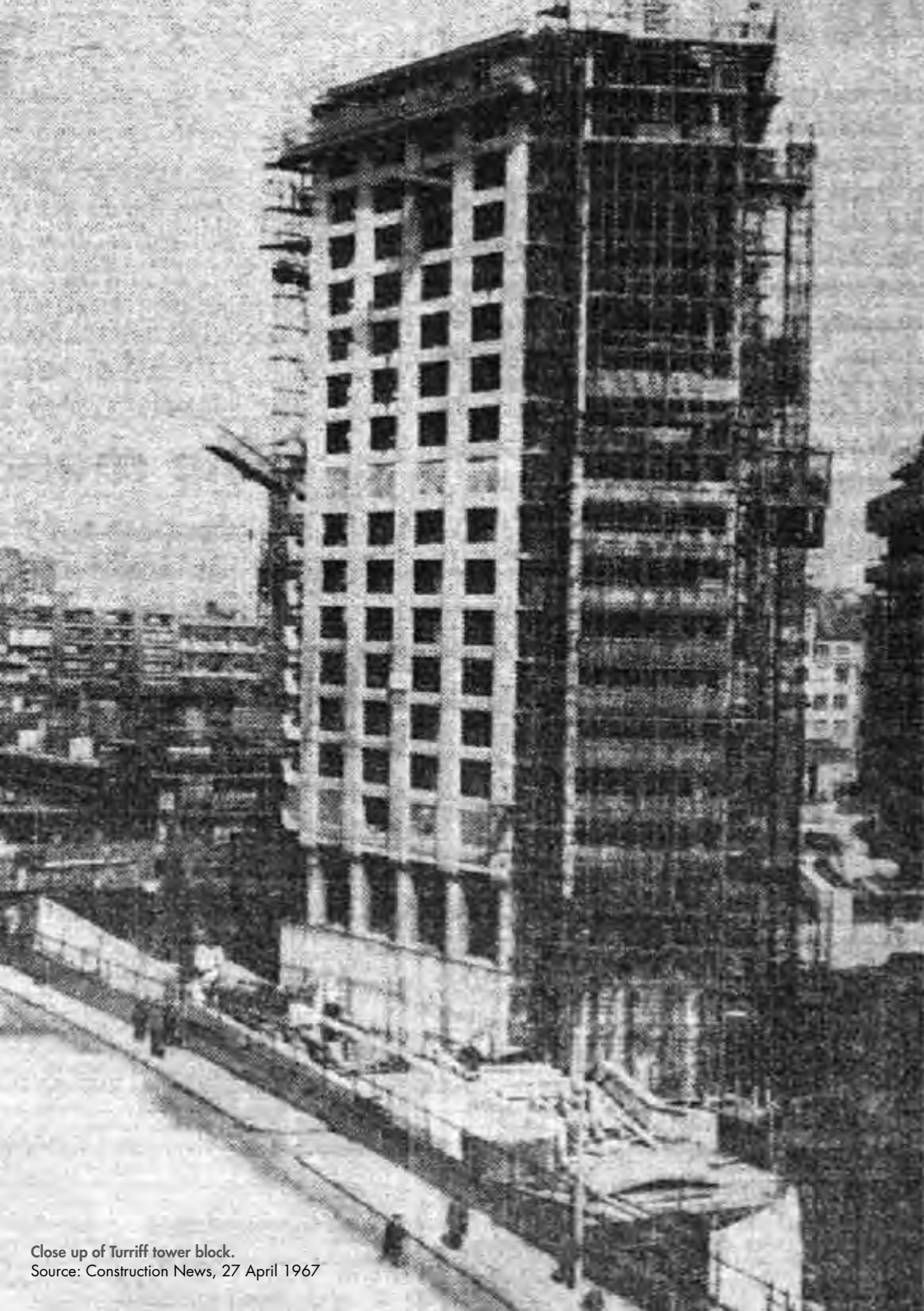
Close up of Turriff tower block.