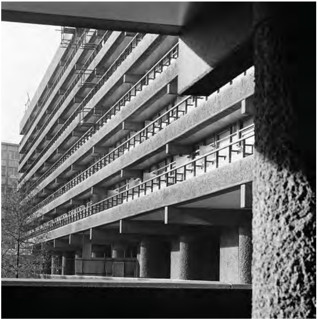
Flats on the Barbican Estate

Phase IV of the Barbican development went out to a selective tender in the summer of 1964. This phase was similar to phases II and III, minus the 43-story tower, and contained 573 flats, commercial showrooms, a hostel, car park, two pubs, a petrol station and a restaurant. Mowlem won the contract to clear and pile the site, worth £220,801, but did not enter the bidding for the building work, which was awarded in November 1964 to Myton, a subsidiary of Taylor