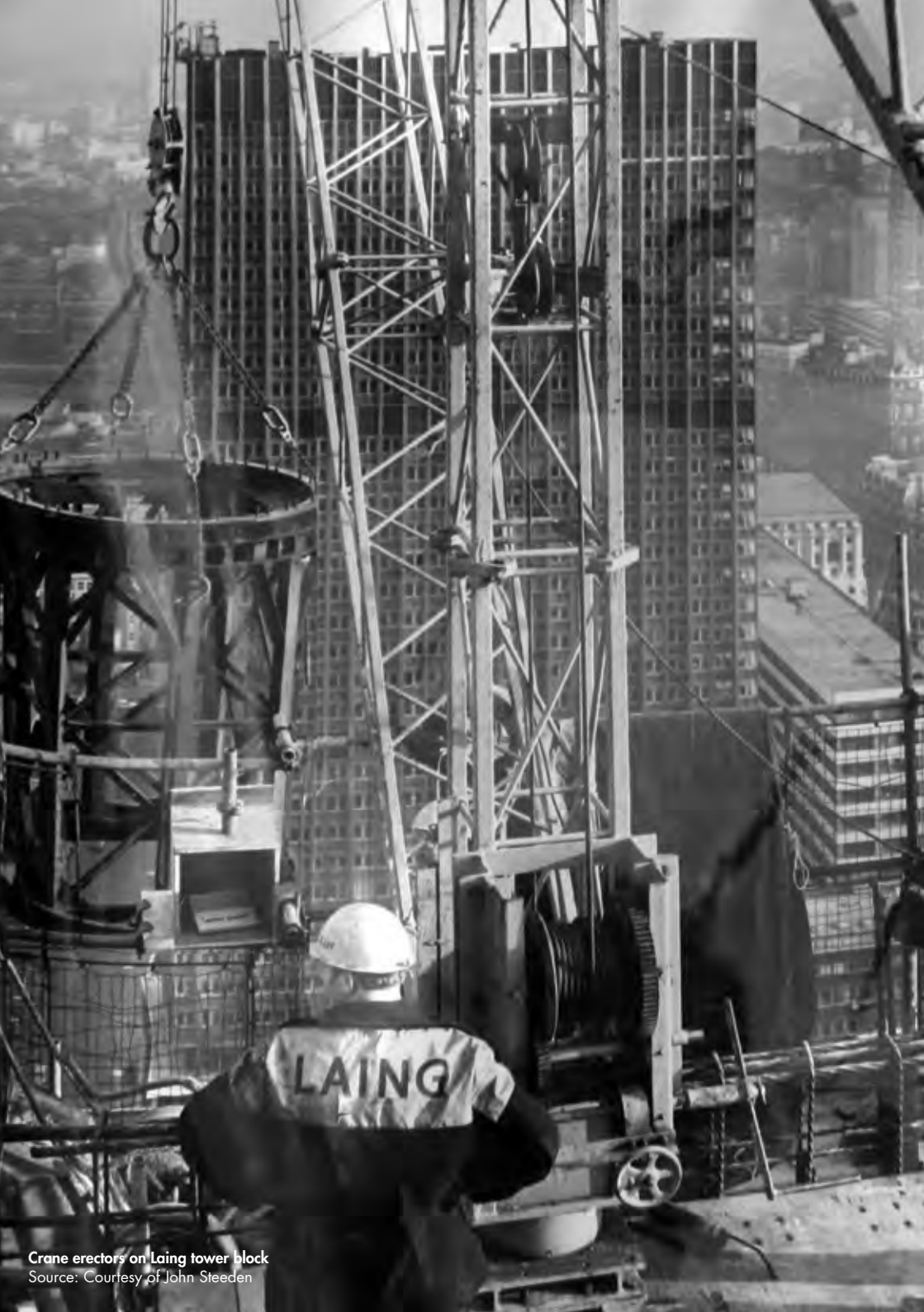
Crane erectors on Laing tower block