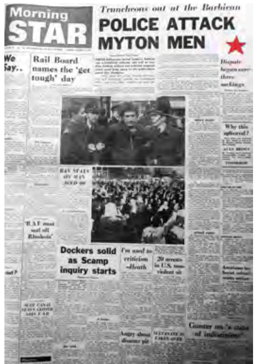
Front page.