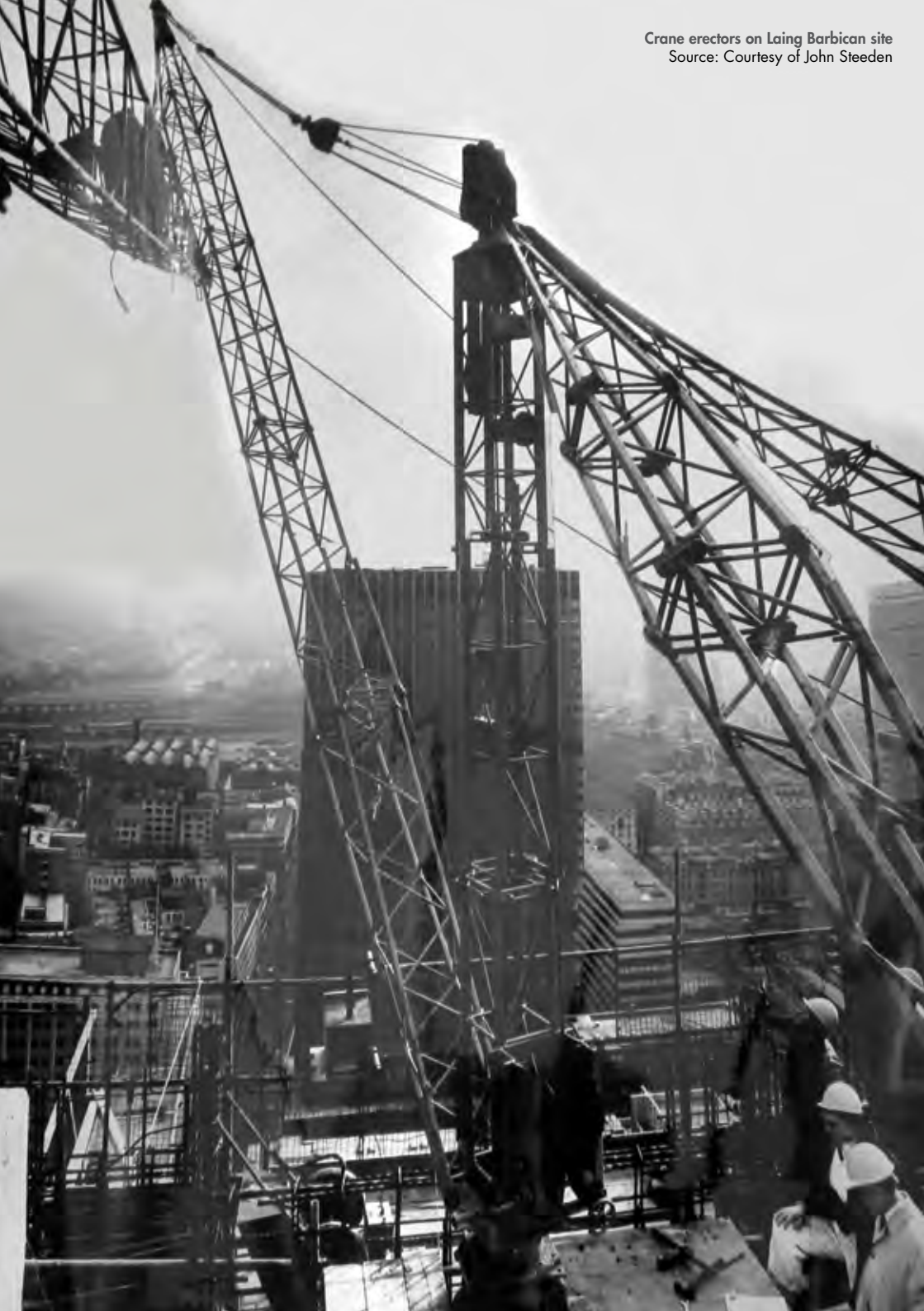
Crane erectors on Laing Barbican site