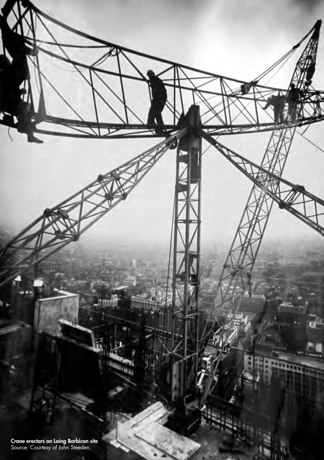
Crane erectors on Laing Barbican site