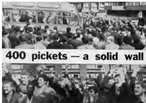
Mass picket at Myton site, following attempt to break strike.