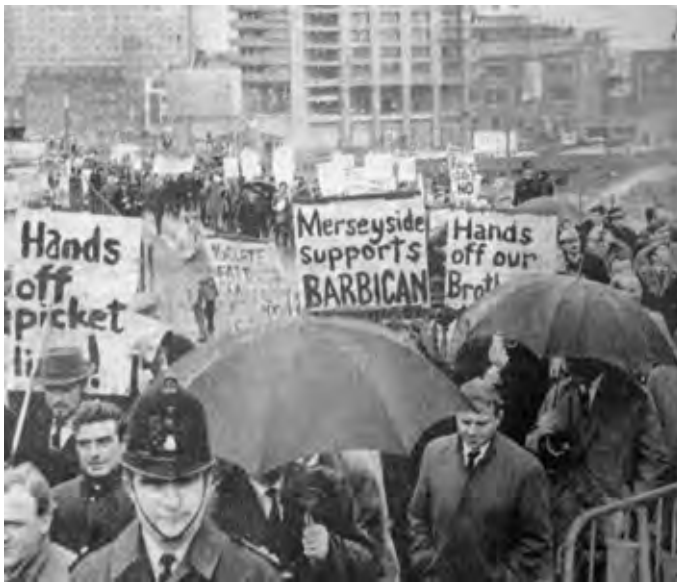
Final rally on 2 November.