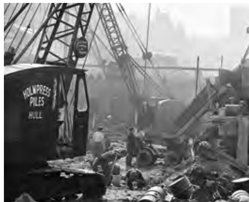
Early stages of the Barbican scheme, photograph c.1963 by John Gay. © English Heritage. NMR Reference Number: AA099222

Well, it impressed you, the size of the contract, because Laing's probably had the biggest part of the contract because they had the one tower block and I think it was four smaller blocks that went round in a square, with like a lake in the middle, and they also built the Barbican Centre, the Theatre and that. That was all part of Laing's.