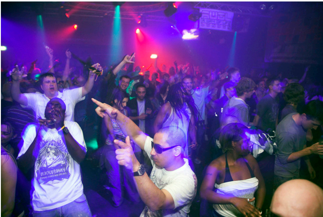
FIGURE 3: THE DANCE FLOOR AT THE WORLD'S LONGEST RUNNING DRUM 'N' BASS CLUB, A.W.O.L., MARCH 2007.