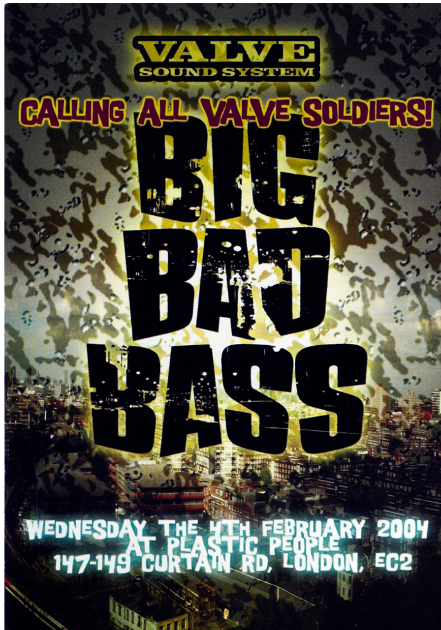
FIGURE 4: FLYER FOR THE VALVE SOUND-SYSTEM'S BIG BAD BASS EVENT AT PLASTIC PEOPLE, FEBRUARY 2004.

Throughout the visual iconography of drum 'n' bass, technological fetishisation often takes the form of a sexualised female cyborg, or “cybernetic organism” (see fig. 5). This fetishisation can be seen to belong to a long history of the eroticisation of technology as a response by male labour and cultural power to the threat of machines. For example, Andreas Huyssen describes the robot Maria in Fritz Lang's Metropolis as the “vamp in the