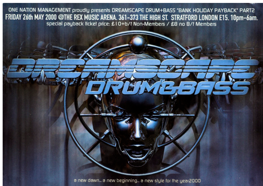
FIGURE 5: A “VAMP IN THE MACHINE” ON A FLYER FOR A DREAMSCAPE RAVE, MAY 2000.

machine”, designed to seduce the insurgent proletariat into submission (Huyssen 1982). Similarly, Rietveld shows that Maria’s purpose is to “normalise the male experience of new technology” (2004: 56). Huyssen argues that the “fears and perceptual anxieties emanating from ever more powerful machines are recast and reconstituted in terms of the fear of female sexuality, reflecting, in the Freudian account, the male’s castration anxiety” (1982: 226). Thereby, technological fetishisation enables the social “castration” of male labour power to be mitigated by investing technological culture with the “naturalness” of female sexuality. 17 In drum ‘n’ bass culture, technology is also often fetishised in terms of the female body’s urban uncanniness; she is imagined as a reproductive machine that has castrated male labour from its “natural” position of power in industrial society. On dance event flyers and record sleeves, mechanical vamps are often situated in post-apocalyptic imagery of the city derived from dystopian science fiction films like Blade Runner . In this way, she briefly resolves male castration anxiety—both in the immediate, post-industrial context and in the deeper, psychological sense—through a return to the fullness of the chora as the original “home”, thereby seeming to “complete” the mother’s own castrated body.