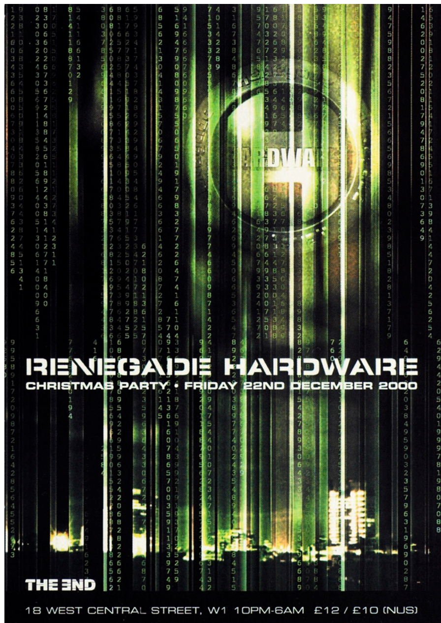
FIGURE 1: FLYER FOR RENEGADE HARDWARE CLUB NIGHT AT THE END, LONDON, DECEMBER 2000.

Throughout drum ‘n’ bass culture, the “future” is marked by the subject’s vulnerability to control by the code, where media technologies are also technologies of surveillance and social control. The hegemony of the code in the Renegade Hardware flyer is signified in terms of the extent to which all living and non-living activity in the post-industrial city is subject to its operation. As a medium of control—indicated by the monolith—the code is defined as immanent and all-powerful. Phillip Tagg’s view that low sounds in Western