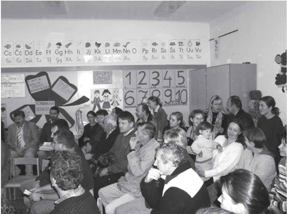
Figure 3: Local residents at the presentation of the results of the joint Ljubljana-London Masters' module in Solčava school, September 2004

Sustainability (in general) and the management of protected landscapes (in particular) are explicit foci of the two postgraduate programmes – the University of Ljubljana Masters' in Natural Heritage Protection and the University of London Masters in Environmental Management – for which the 2004 field study comprised a joint module in sustainable tourism management. The principal aim of the module was to assess the prospects for sustainable tourism (protecting the natural and cultural resource whilst maximising the benefits for local residents) in the region, in relation to protected landscapes.