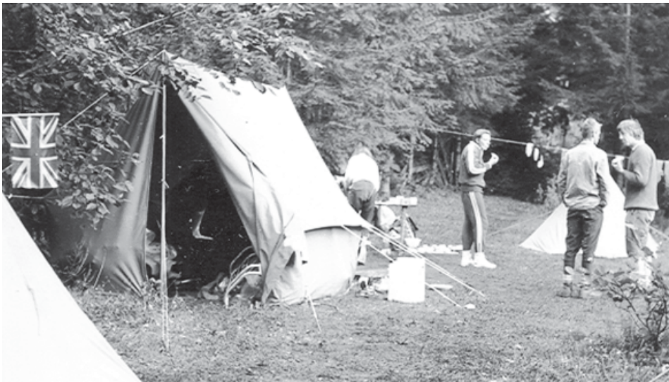
Figure 2: The Brathay camp site near the entrance to Logarska dolina in 1972. Note the Union Jack to the left of the tent