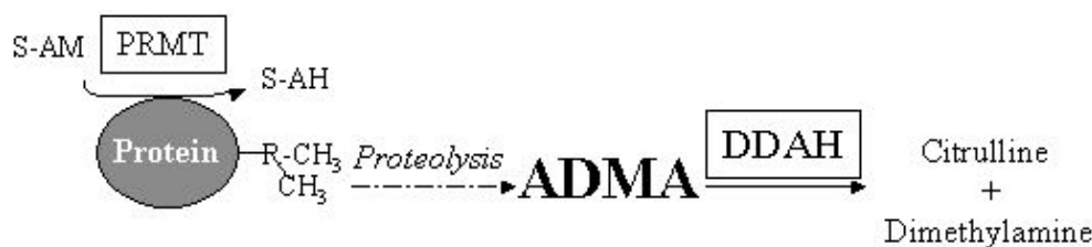
Fig. (2). Formation and metabolism of ADMA.

Arginine residues on proteins are methylated by PRMTs with S-adenosylmethionine acting as a methyl donor. Free ADMA is released as the protein undergoes hydrolysis and proteolysis. DDAH metabolises ADMA to citrulline and dimethylamine. (Protein arginine methyltransferase (PRMT); S-adenosylhomocysteine (SAH), S-adenosylmethionine (SAM); dimethylarginine dimethylaminohydrolase (DDAH).