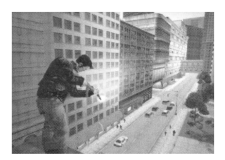
Fig 3: Screen shot from Grand Theft Auto.

How much control should the user have over what happens, and how far should this be guided by the technology? A factor discussed by Jordan [9], and Norman [15] (in the form of 'constraints'). When is it necessary to design an interface that constrains the user to avoid making mistakes, and when is it possible to allow greater flexibility? Only a proper study of context can decide these issues. Understanding who the game is for ie reviewing its 'Identity' will dicate the level of control, A way of avoiding a high cognitive load is for the technology inside of an interface to take more of the decision making away from us, thus also helping to avoid mistakes.