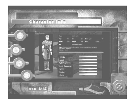
Fig 5: Example of interface redesigned to be more compatible with expectations, created by Vi Bang, Westminster Student. The buttons were designed to be intuitively connected with their function and remained in the same place on consecutive screens.

consistent throughout a design or more broadly keeping the whole interface consistent with our likely mental model of it. It is mentioned by Jordan, Johnson, Preece et al.