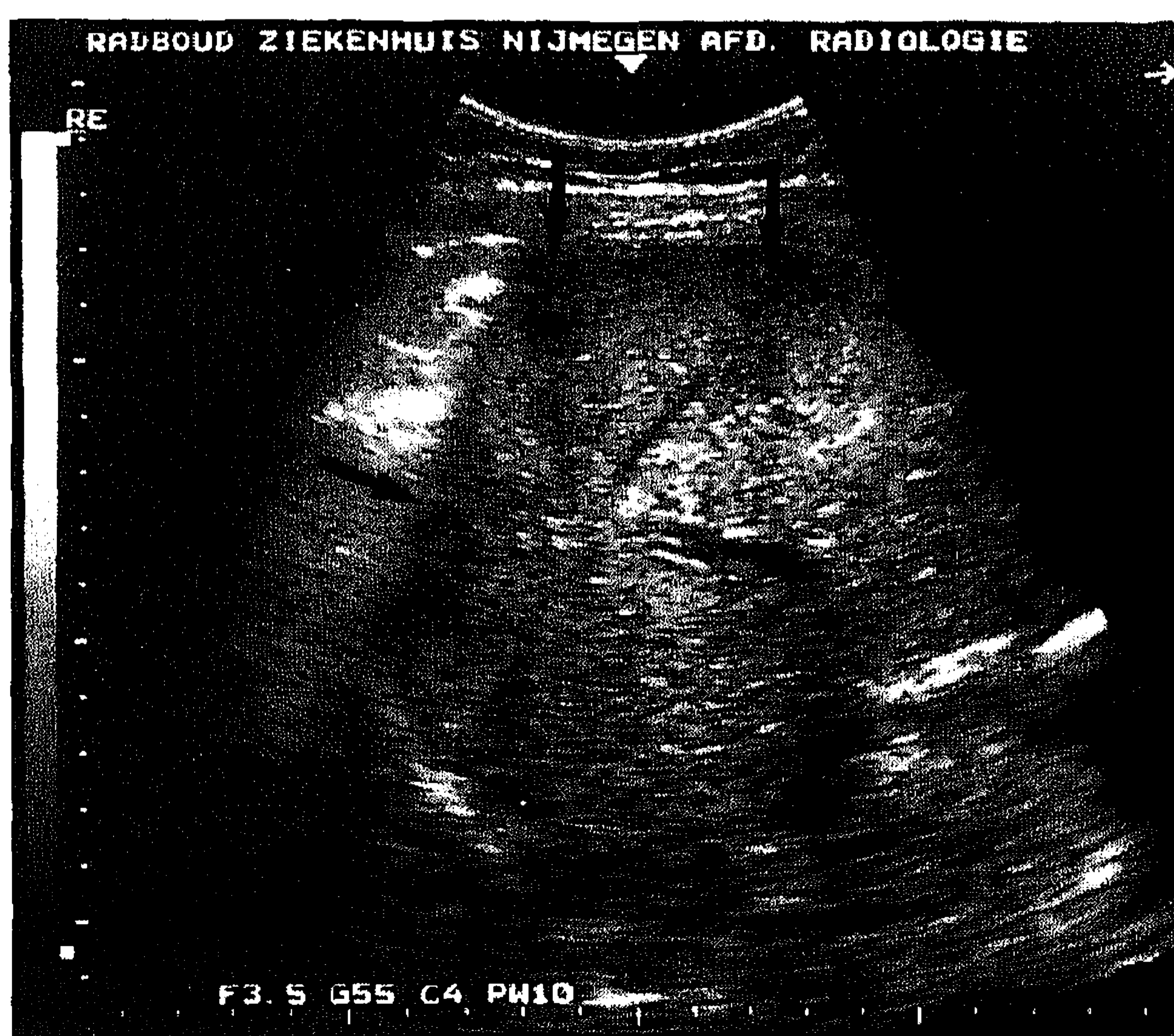
Fig. 1. Ultrasound image of the right upper quadrant, demonstrating multiple small subcapsular lesions in the right liverlobe (arrows).

During the next 2 days the blood pressure normalized; the liver functions and the haematological and coagulation data gradually improved (Fig. 2). Renal function, however, deteriorated with persistent oliguria ( <400 ml/day) and an increase in serum creatinine to a maximum level of 969 \mu\text{mol/l} (Fig. 2). Fluid intake was restricted. Urine findings were compatible with acute tubular necrosis. A high dose of furosemide failed to increase diuresis. On the third day postpartum, hemodialysis was started because of azotemia and pulmonary edema. Ultrasonographic examination disclosed ascites; the echogenic liver lesions were unchanged. During the