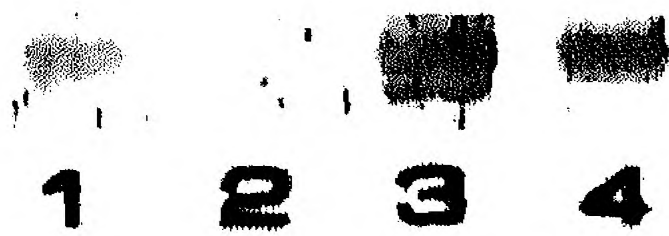
FIG. 2. Expression of SLeX on partially purified AGP from hyper-IgD sera. Equal amounts of affinity-purified AGP [3 \mu g as determined by radial immunodiffusion (23)] were subjected to SDS-PAGE, subsequent blotting, and detection of SLeX with a specific monoclonal antibody (CSLEX-1) as described under Materials and Methods. A representative Western blot of AGP from one hyper-IgD patient is shown; only the part of the blot containing AGP bands is reproduced. 1, AGP from control serum; 2, AGP nonreactive with AAL; 3, AGP from hyper-IgD serum during remission; 4, AGP from hyper-IgD serum during an attack.

11 different patient sera (chosen at random) was subjected to SDS-PAGE, blotted, and subsequently stained with a monoclonal antibody directed against SLeX (CSLEX-1). A representative Western blot of AGP isolated from one patient is shown in Fig. 2. Upon staining of AGP-containing nitrocellulose strips with CSLEX-1, a weak positive staining of AGP from sera obtained from healthy individuals was observed (Fig. 2, lane 1). A strongly enhanced positive staining was observed for AGP isolated from hyper-IgD patients during remission and febrile attack (Fig. 2, lanes 3 and 4, respectively), indicating a significant increase in the expression of SLeX on AGP in the hyper-IgD syn-