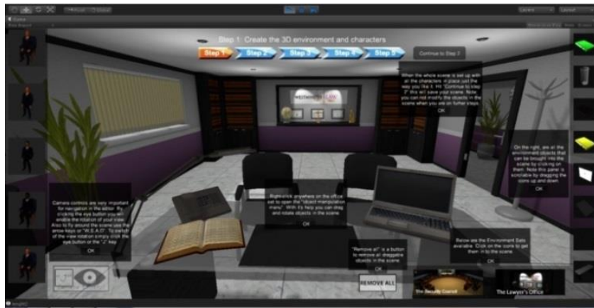
Figure 1. A screenshot of the edit mode of the wmin SGP that provides guidance to the user to edit the scene and use the available editing tools.

The wmin SG platform has been developed using Unity 3D game platform [10] coupled with the ICT Virtual Human toolkit [11]. The latter is an open-source collection of modules, tools and libraries that facilitates the creation of ECAs. Its main render is Unity3D that makes contents created with the toolkit accessible through the WWW through Unity's Web player.