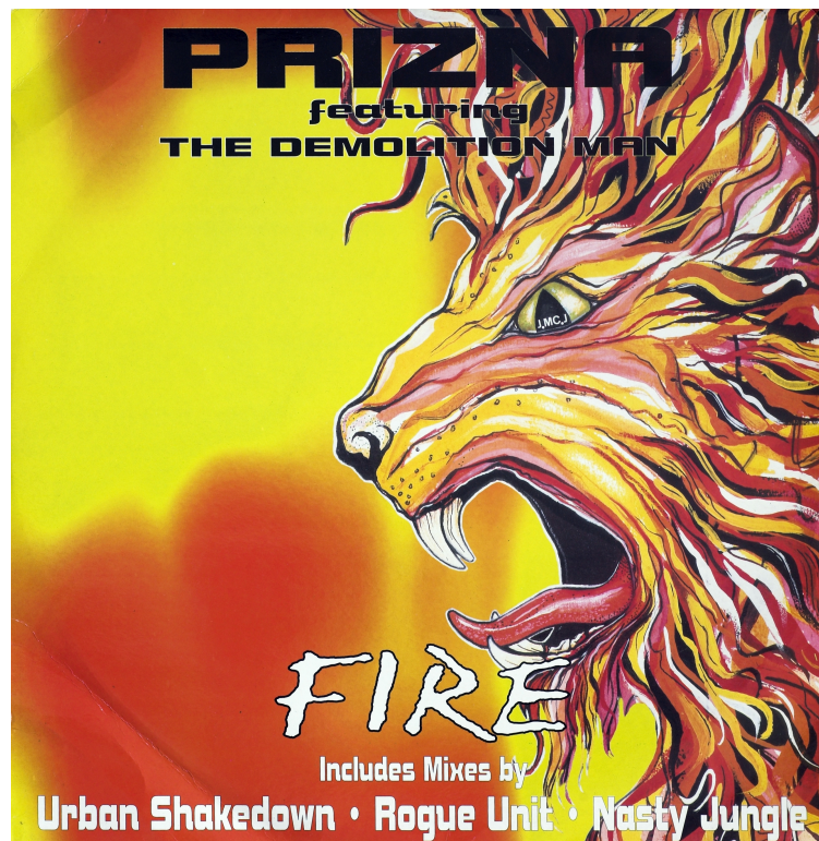
Figure 1: A representation of the “Conquering Lion” on the record sleeve for “Fire”, by Prizna featuring The Demolition Man (1995).

righteousness prevalent in the Rastafarian-inflected narratives of dub and reggae sound system culture. The adoption of such an image in the context of UK drum ‘n’ bass points to Gilroy’s reading of W. E. B Du Bois’ concept of “double consciousness” in Black Atlantic culture; the double meaning of the “urban jungle” as a “dread” space of sinful transgression (1993: 77) takes place at the same time that participation in jungle music is constructed as providing divine strength and inspiration.