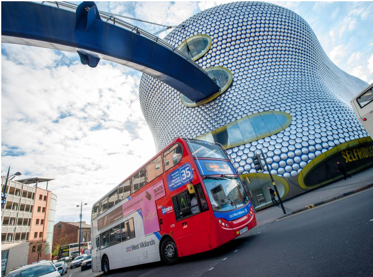
Figure 2: the Selfridges Building, Birmingham