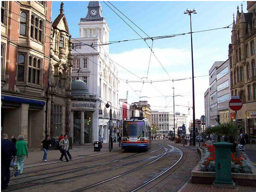
Figure 15: Tram & High Street, Sheffield