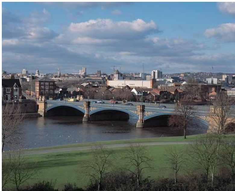
Figure 12: Trent Bridge, Nottingham

economic growth and the case for city devolution" (Core Cities nd). Nevertheless, it has not featured prominently on the international landscape of 'smart' urban innovation. This may well change in future: it was recently named one of the UK's 'top ten' smart cities in a recent report commissioned by Huawei (Woods et al. 2016). Though not positioned among the 'leaders' in this report, Nottingham was bracketed with Sheffield as a 'contender' city, which has developed a smart vision and has begun to implement some significant specific activities.