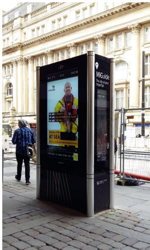
Figure 8: one of the MiGuide digital information points in Manchester City Centre

Flow Energy Systems’ project to support electric vehicles at Manchester Science Park, and the ‘MiGuide’ digital street wayfinding service currently operational in the city centre. Its embrace of ‘New Technologies’ (Manchester City Council, 2016a), exemplified by “sensors, LED lighting, smart ticketing, or low carbon technology such as electric vehicles or solar panels” (Manchester City Council 2016a), is complemented by the principle of ‘New Ways of Working’ (integrating systems, exploiting big data to manage the city in real time, and providing better information for residents, workers and policy-makers).