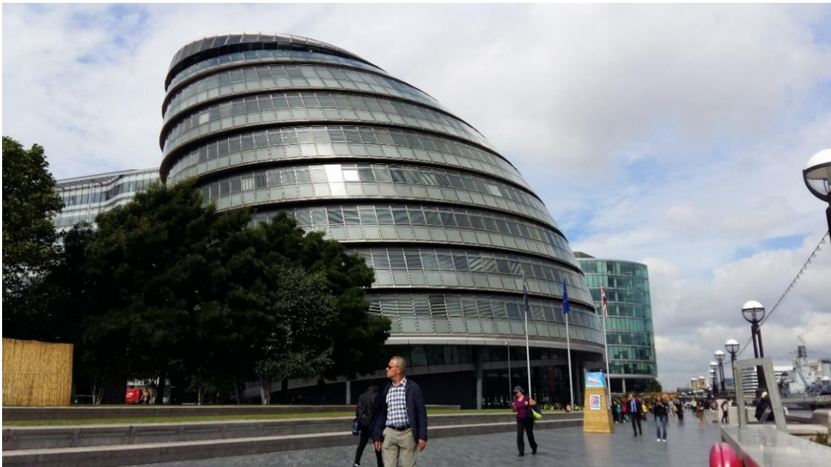
Figure 6: City Hall, London

– relating to infrastructure, services and governance – for which consequently diverse ‘smart’ solutions need to be found. The latter are predicated on exploiting the benefits of open data and digital technology to address governance complexity and enhance socio-economic and environmental innovation.