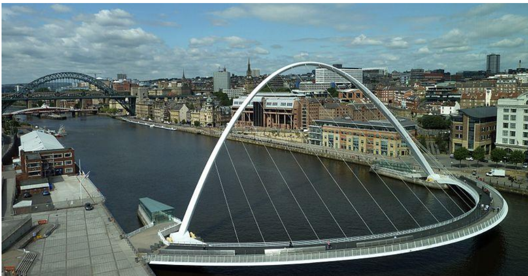
Figure 11: The River Tyne in Newcastle City Centre

from the decline of heavy industry, but has made efforts to promote itself as a centre for hi-tech and low-carbon industries. Policies and promotional materials relating both to the Science Central project and the broader economic strategies for the city region mobilise a narrative of continuity with, but transformation of, the city's industrial heritage. The symbolic charge of Science Central being developed on the site of a brewery and a nineteenth-century coal mine is exploited in the documentation.