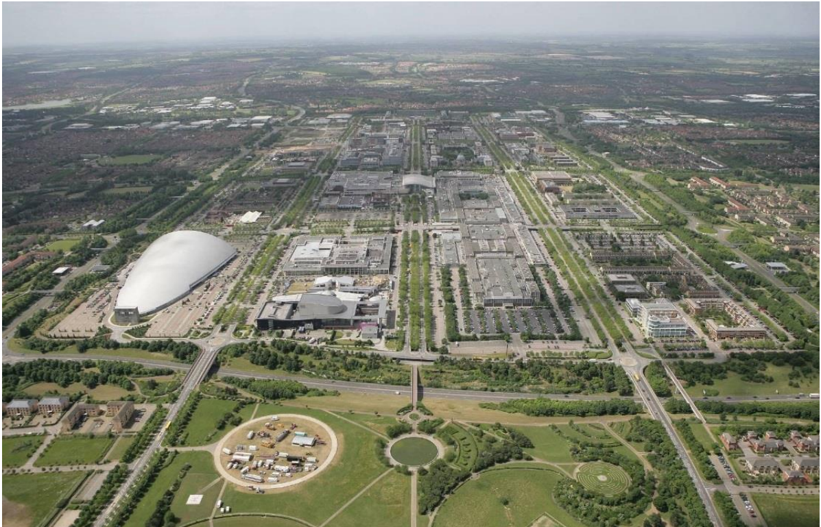
Figure 10 Central Milton Keynes Source: Green Digital Charter

http://www.greendigitalcharter.eu/wp-content/uploads/2012/10/Milton-Keynes.jpg