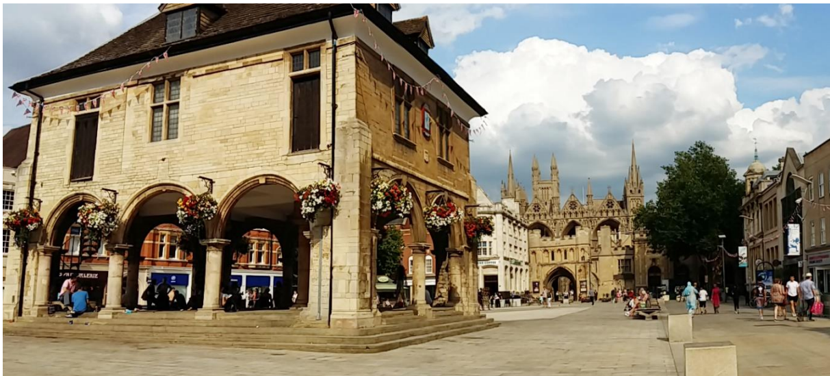
Figure 14: Cathedral Square, Peterborough

2012-13, Peterborough came second and was awarded £3 million to develop the Peterborough DNA project (see details below). Peterborough was also awarded the Smart City of the Year 2015 award at the World Smart City Congress held in Barcelona in late 2015, coming top of a list of 265 cities (Opportunity Peterborough 2015). In the competition, Peterborough was ranked higher than global contenders such as Dubai, and higher than other UK entries. On the UK smart cities map, Peterborough is widely ranked higher than Cambridge, its more academic rival and neighbour.