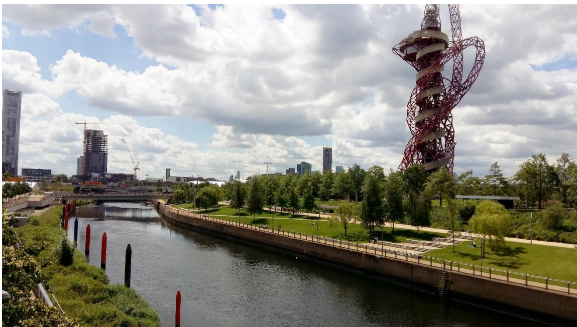
Figure 7: Queen Elizabeth Olympic Park

growth through digital technological innovation and governance is, then, also reflected in the various pilot initiatives and programmes put in place to implement the strategy. For example, the Talk London initiative recently featured a discussion forum on London's housing crisis and related policies aimed at increasing the number of houses built; another discussion strand engages with strategies and initiatives for local regeneration. The latter has also been a focus of the Civic Crowdfunding pilot programme, which emphasises support for unique, bottom-up place making initiatives, such as regenerating parkland, and turning brownfield land into organic urban farms.