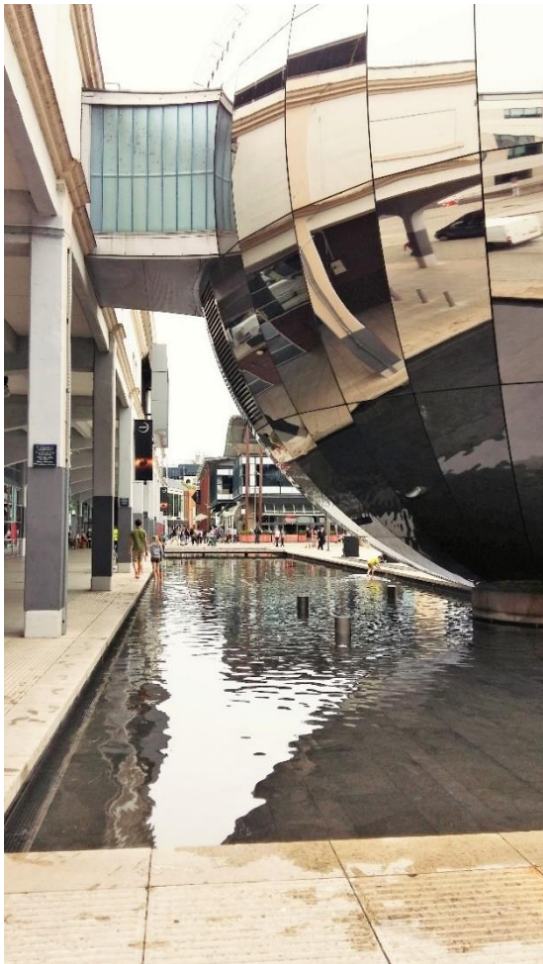
Figure 3: At-Bristol Planetarium

the city is expected to increase its population by over 20% by the end of the 2020s (Hudson 2013). Bristol's smart city ambitions risk being side-lined if the city becomes a 'London lite': a city that is not only expensive but unaffordable, where transport and mobility is slow and costly, and where the poor and low-paid are increasingly side-lined and excluded from the glittering visions of Bristol as a 'smart' capital for the South-West