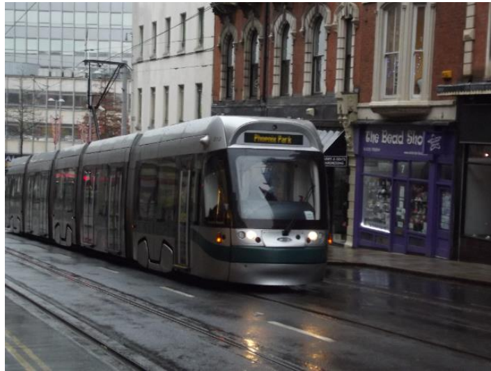
Figure 13: Tram in Nottingham City Centre