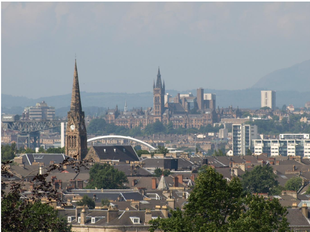
Figure 5: A View of Glasgow from Queens Park

their assumptions on the power of data to provide opportunities for business, and to improve governance because of better collaboration. Nevertheless, entrepreneurs and other users of data are largely silent in these core strategic documents.