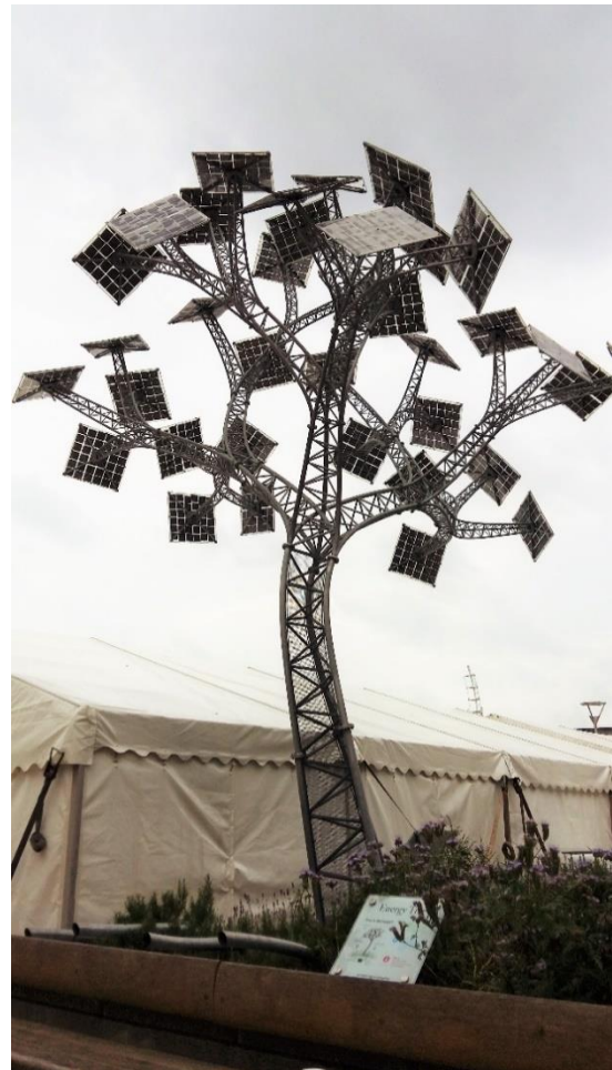
Figure 4: Energy Tree, Millennium Square, Bristol