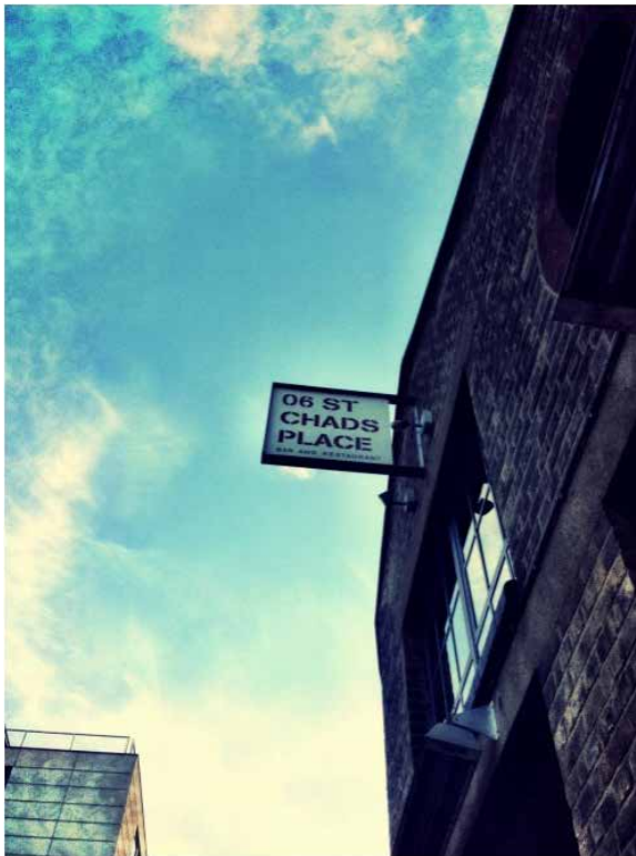
Figure 5. Photograph of the venue for forthcoming Apero-blog London meet-up

Having established that it is the physical location of the next meet-up that has supremacy on the screen, demonstrated both through its superordinate left-hand positioning along the written rubric titles and substantiated intermodally by means of the photograph of the venue (Figure 5) – which fills half the screen in a single frame – it is now necessary to examine briefly the photograph itself. The semiotic dominance of the image within the multimodal