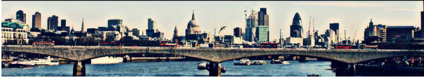
Figure 2. 'London Tips' page banner.