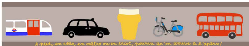
Figure 3. Apéro-Blog London banner (on every page except 'London Tips').