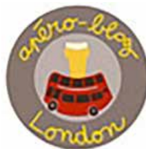
Figure 6. Apéro-blog London logo