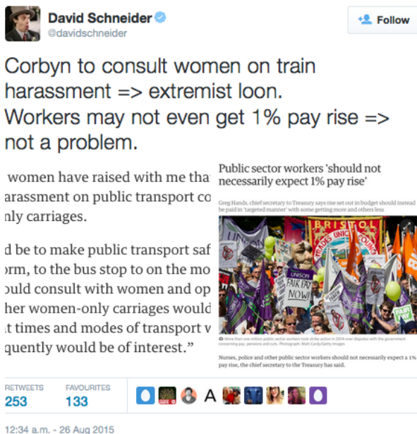
Figure 5: The comedian David Schneider’s response to anti-Corbyn discourse