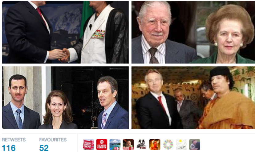
Figure 2: A Twitter-critique of the BBC Panorama documentary on Corbyn that uses visual dialectical reversals by showing images of Gordon Brown and Tony Blair with Gaddafi, Blair with Assad, and Thatcher with Pinochet.

#Panorama cheap smear campaign against Corbyn tonight trying to link him to terrorist group short memory of this