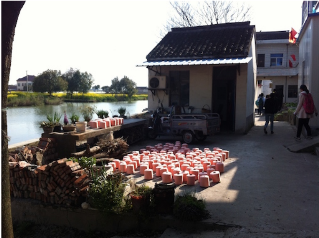
Figure 2. Many textile activities are home-based and represent an important component of the local economy, employing a significant amount of migrant workers.

The main concern of the village committee, at the time of the preliminary discussion in April 2015, was about the need to redefine a profitable local development strategy for the village, as almost 50% of the area's fishponds needed to be reclaimed in order to meet the provincial quota of cultivated land. This would have implied a potential loss for local farmers' and consequently income for the village 11 . The leaders were not explicitly addressing heritage preservation, but they were generally in favour of strengthening the local historic identity, as many other successful rural villages have done for incrementing their tourism visibility. The intention of setting-up a participatory workshop was, moreover, to get consensus regarding a shared development vision for the future from local people and, meanwhile, to inform them of the new top down stricter environmental measures that would have potentially curbed the local economy.