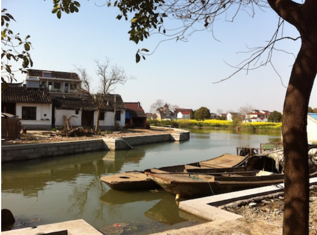
Figure 1. The historic buildings are mainly concentrated in the south part of Shuang Wan along the main canal.

economy is mainly based on family workshops and SMEs, specialized in garment on-line selling (Fig. 2). Meanwhile, most of the traditional agricultural activities like aquaculture and rice planting have been leased out to subcontractors.