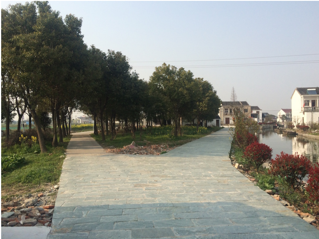
Figure 5. The new road with a pedestrian friendly pavement is one the outcomes of the workshop which was realized in March 2016.

identified for its intrinsic heritage value hasn't been formally protected nor its buildings listed yet.