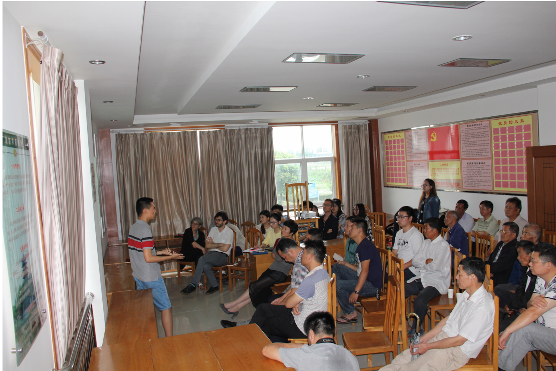
Figure 4. The presentation of the workshop's results in the village town hall, 12 th July 2015.

Clearly, the topic of heritage conservation is one of the most controversial to implement: on one hand, it forms part of a long-term vision for most of the local people (those consulted during the workshop and those who are in the position of decision-making); on the other hand, it is a symbolic element of deprivation for migrant workers, who have no say in the local decision making.