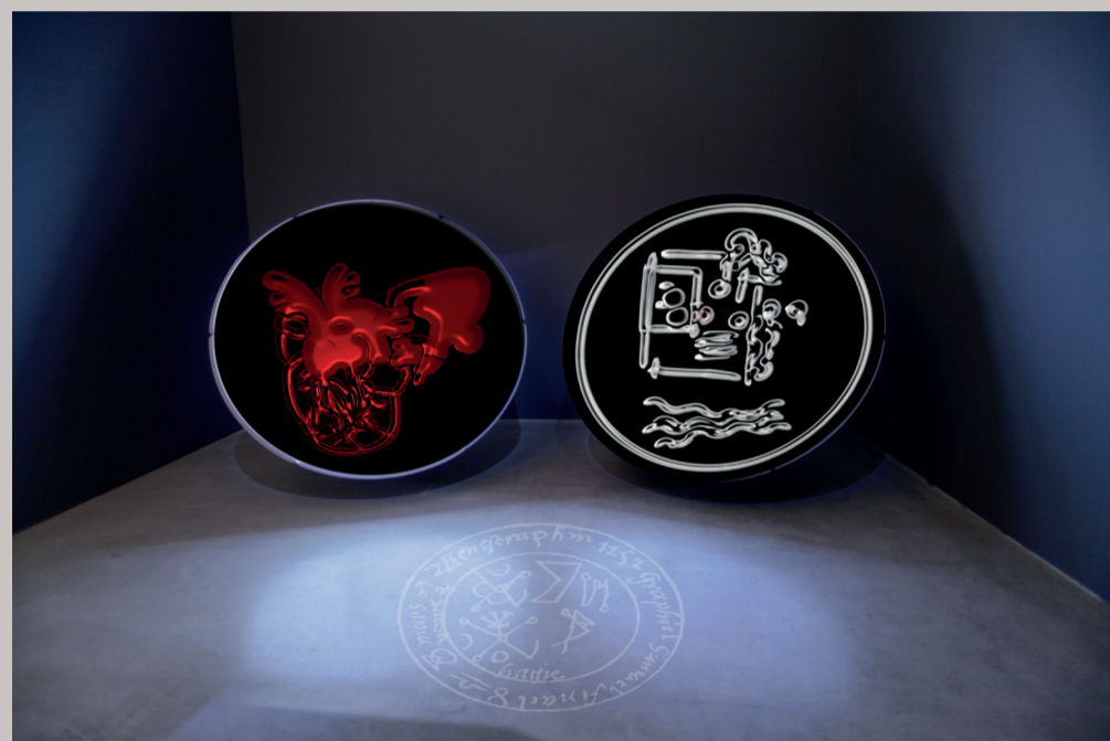
Lindsay Seers, Mental Metal , 2017