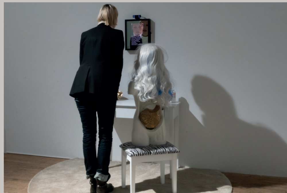
Lynn Hershman Leeson, Venus of The Anthropocene , 2017