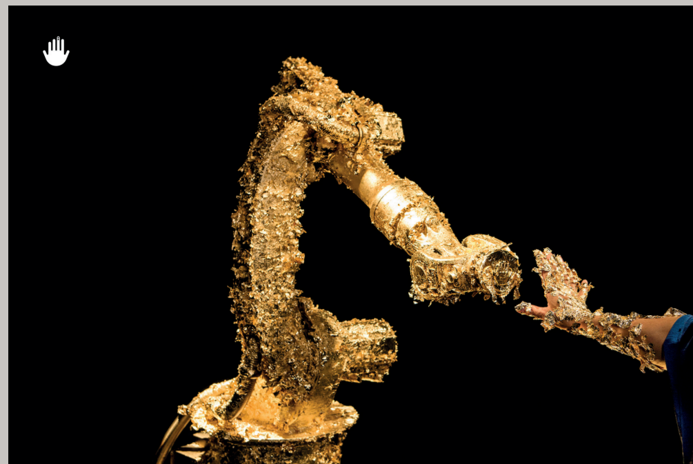
Federico Díaz, BIG LIGHT , 2016.