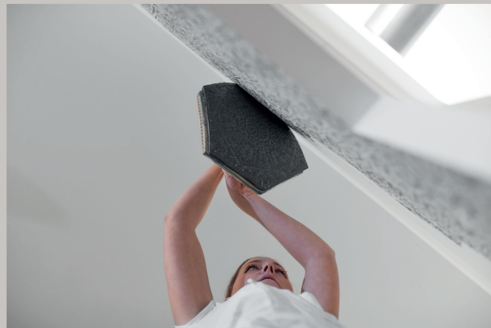
Jasmina Cibic, Building a Long Passageway , 2013.