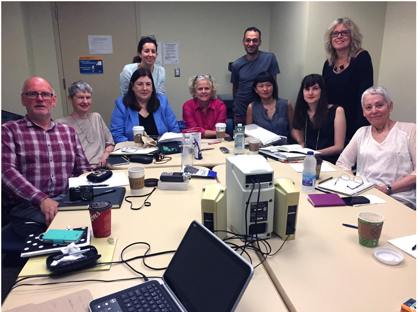
Figure 1 Team photo: working session, September 2016.