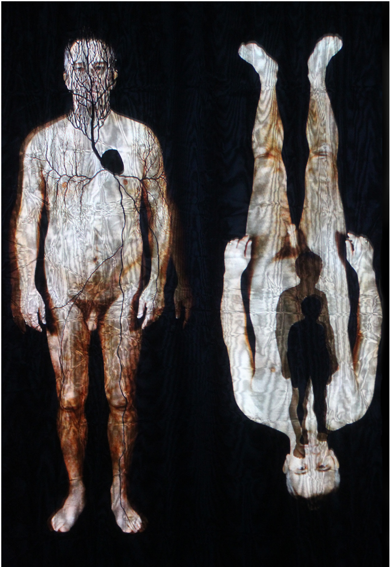
Figure 3 Andrew Carnie, A Change of Heart , detail of still from a 2 Channel HD Video, 2012.