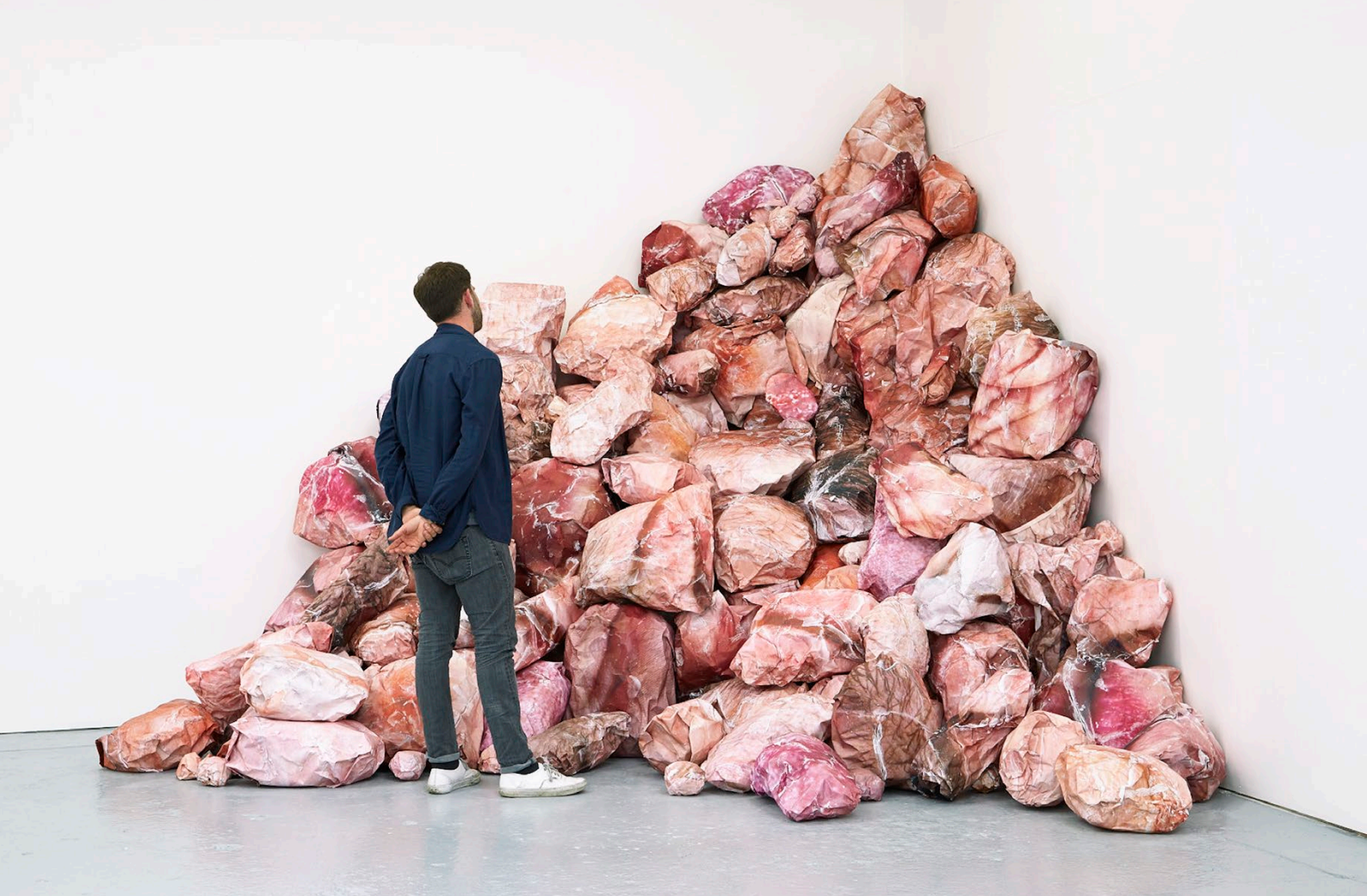
Figure 2 Alix Marie, Orlando , installation, dimensions variable, 2014.

sculptural terms. 18 And indeed, Robertson's works evoke painterly abstraction and a handmade craft textile tradition. Yet for anyone who has ever printed a large color photograph, a work like 113 also evokes the romance of the darkroom: the smell of the chemicals, the unpredictability of the processes, the inevitable accidents caused by working in darkness and the skilled care involved in handling a long strip of paper without mangling it. At a moment when digital printing has separated the final photographic image more than ever from its means of production, Robertson's works turn attention to the materiality and labor of chromogenic print-making.