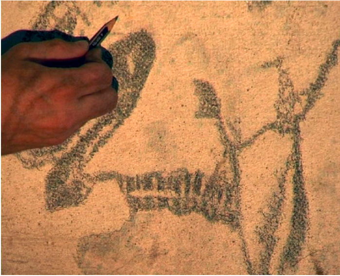
Figure 4. A hand sketches on the wall. Still from El predio (2010).

an unusual skull framed in the centre of the screen. The artist's body is hunched, cross-legged, occupying the left vertical edge. A straight line of light, parallel with this boundary, divides the space. The artist sits in darkness; the drawing is bathed in golden light. He is drawing on a wall. Various pencils lie scattered on a sheet of bubble wrap on the floor. Sound continues as before, rumbling silence and scratching. Cut to a wider shot. The artist occupies the corner of a dimly lit room. A projector throws a square of light onto the facing wall, the bottom edge aligned with the base of the wall. The artist traces the image onto the surface. The wall contains numerous holes which have been filled, but not finished. Birdsong is heard. (Figure 4)