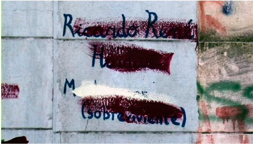
Figure 8. Obscured tribute. Still from Los muros (2011).