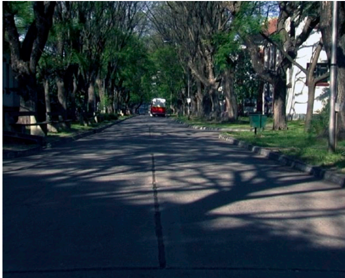
Figure 1. Opening shot from El predio (2010).

into the shot. Ambient sounds convert the flat screen into a three dimensional space inhabited by the audience. The effect is further accentuated by Perel's use of deep focus as the viewer's gaze can wander and select what to view at any given moment. 4