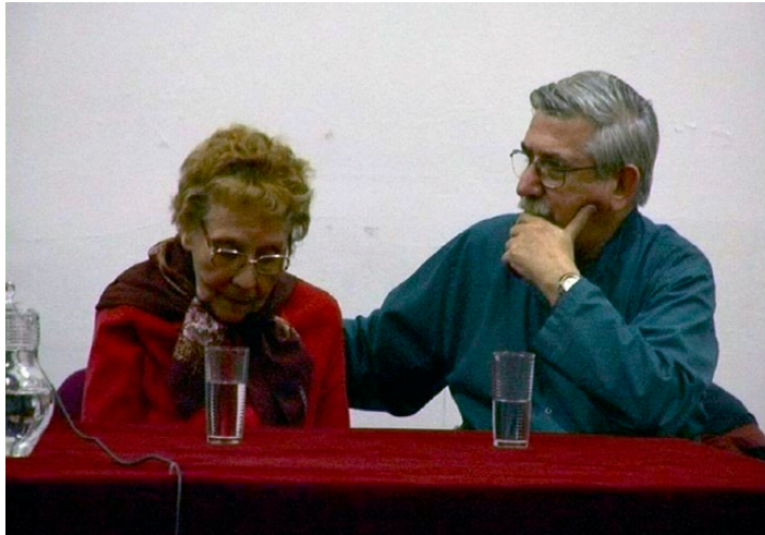
Figure 6. Comforting a speaker at a public discussion. Still from El predio (2010).

takes us to, the work camps, or the search for bones' (pp. 384–385). In a far less positive reading, however, cultural critic Quintín first recognises that the work possibly alludes to themes of renewal, before arguing that 'the film also permits the opposite interpretation: that the occupation of ESMA by political organisations and their activists' alters the site rather than preserves it. That by engaging in the projects of the present, the site produces 'a policy of forgetting in place of a policy of memory'. Quintín finds this argument confirmed in two shots near the conclusion of the film: one consists of an image of a military monument that has had its identifying plaque removed. The other is a plaque commemorating Cristina Fernández de Kirchner and Néstor Kirchner's role inaugurating the space. For Quintín (2010), this demonstrates 'the transformation' which ESMA 'has suffered thanks to the teaching of the new century' and echoes his belief that it has been co-opted into party politics. Nonetheless, in interview, Perel (Reale and Perel, 2011) has acknowledged that El predio was only made possible due to this substitution and stated that it 'reveals everything that has changed in ESMA', an ambiguous statement which need not be interpreted in the critical manner adopted by Quintín.