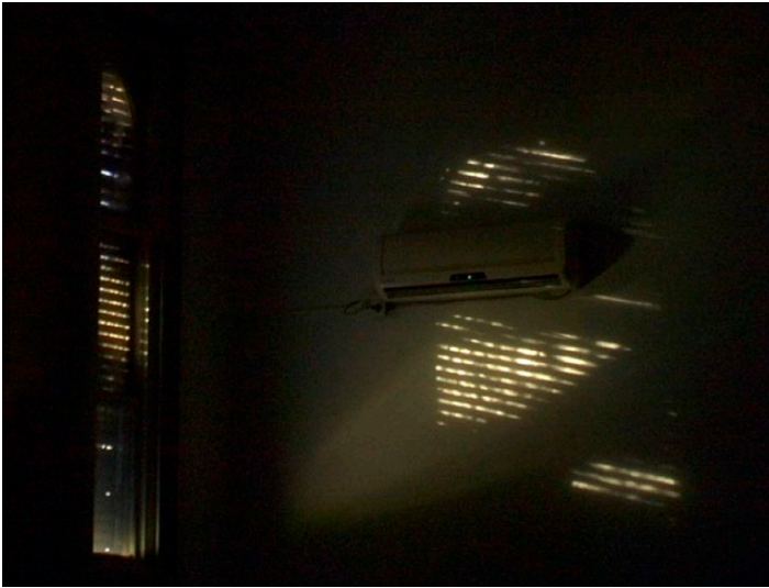
Figure 5. Light breaking through a shuttered window. Still from El predio (2010).

pitched almost electrical crackle endures for several seconds. Is it the sound of adhesive tape being peeled from its roll? There are rapid dull thuds that could be distant footfall elsewhere in the building, and the faintest trace of muffled speech, so delicate that one cannot be sure. A black shadow moves up the screen. As it ascends, the foremost edge is briefly illuminated forming the silhouette of an arm and a head, leading to the conclusion that the original object is a step-ladder. Longitudinal waves of light appear, undulate momentarily and disappear. Cut to a brightly illuminated room, an auditorium filled with neat rows of foldable chairs. Half are occupied with people facing a white wall flanked by large black speakers. In the rearmost bank, only three chairs enter the frame. The backs are matte black, smooth and enclosed in strips of aluminium, curved across the top of the chairback and straight-edged from the endpoints of the curve. Their form confirms it is the same room and the same shot as before. There is the murmur of conversation, identifiable but indiscernible. Blocks of light are extinguished with a click until the room is pitch black. White text appears in the upper part of the the screen. Illegible, its form is nonetheless recognisable as the opening credits of a film. (Figure 5)