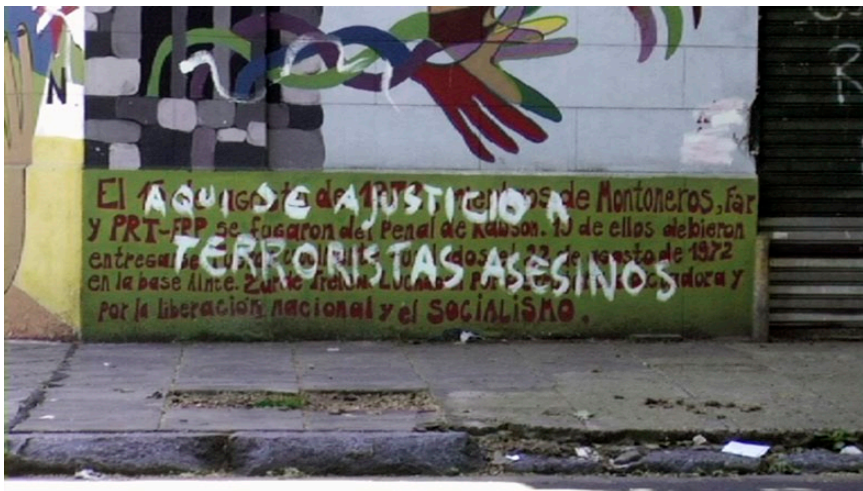
Figure 9. Vandalised memorial. Still from Los muros (2011).

Unlike Perel's first film, Los muros is located within the main urban fabric of Buenos Aires and thus there is far less plant life included in the film. For this reason, the soundscape takes on an even more fundamental role than in El predio . The majority of the shots included in the film feature almost no perceptible movement at all, but capture only the material fabric of the buildings recorded. Chion (1994) argues that within 'a sequence of images [that] does not necessarily show temporal succession in the actions it depicts' the use of 'diegetic sound imposes on the sequence a sense of real time, like normal everyday experience, and above all, a sense of time that is linear and sequential' (pp. 17–18). Due to the almost total lack of movement in Los muros , however, it is the use of environmental sounds that alerts the audience to the fact that the images are in motion at all. From this point, the ear leads the eye and the viewer searches for the intermittent visual micro-rhythms