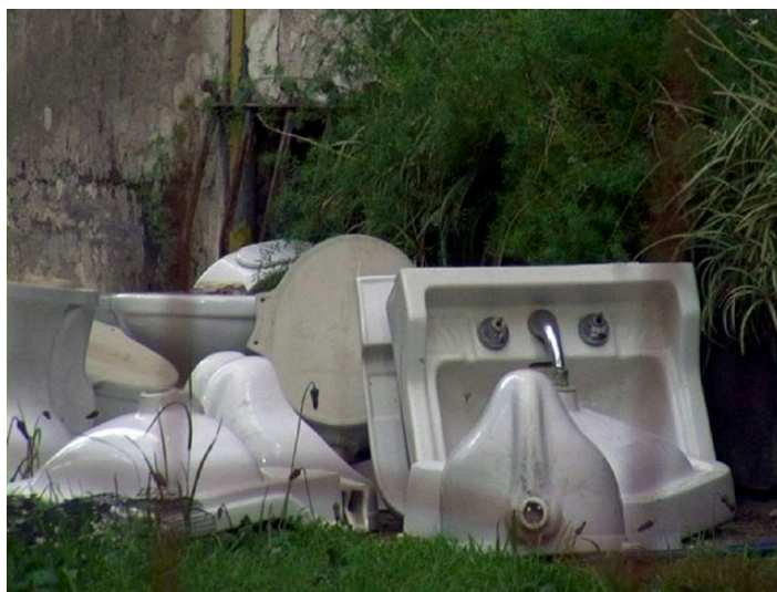
Figure 3. Construction waste. Still from El predio (2010).

to repurpose the strategies employed by the dictatorship when it occupied the site. His unusual angles echo the fact that ‘prisoners have spoken of being able to watch the legs of pedestrians passing outside’, just as the disconcerting arrangement of both sound and vision reflects the fact that the ‘brutality of torture and rape was accompanied by techniques designed to further defamiliarize the space of incarceration, such as blindfolding prisoners and leading them on different routes around the prison to enhance disorientation’ (Scorer, 2016: 34). Perel, too, defamiliarises ESMA and disorients his viewer. However, where such techniques were utilised by the dictatorship as part of ‘the pedagogies of