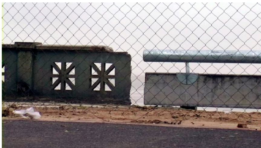
Figure 7. Opening shot from Los muros (2011).

The opening shot of Perel's second film is incongruous with the rest of the text. As Adrián Gorelik (2014) notes, the location can be situated in the 'Costanera Norte' (Northern Promenade) which runs along the northern bank of the Río de la Plata in Buenos Aires. The origin of the sound heard, however, is rather more difficult to trace. The roar of the jet engine could conceivably emerge from the Aeroparque Jorge Newbery (the airport which stands behind the coastal walkway), yet the clarity, volume and intensity of the noise suggest otherwise. Following this establishing shot, the remaining 10 minutes of Perel's short film can be subdivided into three distinct sections, all of which take place in the former CDCs 'El Olimpo' and 'Automotores Orletti' situated in the west of the capital city. No human characters appear at any point in the film. As the first sequence of eight shots records close-ups of walls, windows and shuttered doors shot from unusual angles, it is reminiscent of El predio . The penultimate shot in this sequence serves as a transition to the following section and gives the viewer the first indication of the thematic content of the film. The camera is positioned further back and the screen is largely filled by a garage door which has been heavily spray-painted. In the bottom right-hand corner of the screen, partially visible text spells out '[op]ressors' and 'prison', the first glimpse of the political graffiti which occupies both of the remaining sequences.