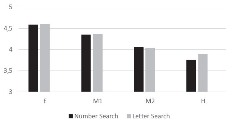
Figure 1. Mean examiner ratings for a 1 to 5 Likert-type scale of persistence at the search tasks assumed to be easy, moderate, and hard. E = assumed easy, M = assumed moderate, H = assumed hard

As described in the Method section, the examiner rated the children's task-directed persistence on a 1–5 scale at each level while the child was working on the computer (Figure 1). Based on these ratings, children's persistence was very similar for the letter and the number search tasks; there were no significant differences between them at any of the levels. However, there were steep significant decreases in persistence as the levels got harder. Repeated-measures ANOVA shows significant decreasing linear trends; the within-subjects statistics for the number search task were: F(1, 100) = 73.71, p < .001 , partial \eta^2 = .424 , and in case of the letter search task: F(1, 100) = 64.48, p < .001 , partial \eta^2 = .404 , which indicates that as the tasks get harder, children were rated by the experimenter as spending a lower percentage of their time focused on trying to match the cards correctly. The cubic (two bend) trend was also significant for the number search task ( F(1, 100) = 5.66, p = .019 , partial \eta^2 = .054 ). Both the quadratic (one bend) trend ( F(1, 100) = 13.37, p < .001 , partial \eta^2 = .123 ), and the cubic trend ( F(1, 100) = 5.07, p = .027 , partial \eta^2 = .050 ) were significant for the letter search task ( F(1, 100) = 5.66, p = .019 , partial \eta^2 = .054 ). The non-linear trends have much smaller effect sizes ( \eta^2 ) than the linear trend.