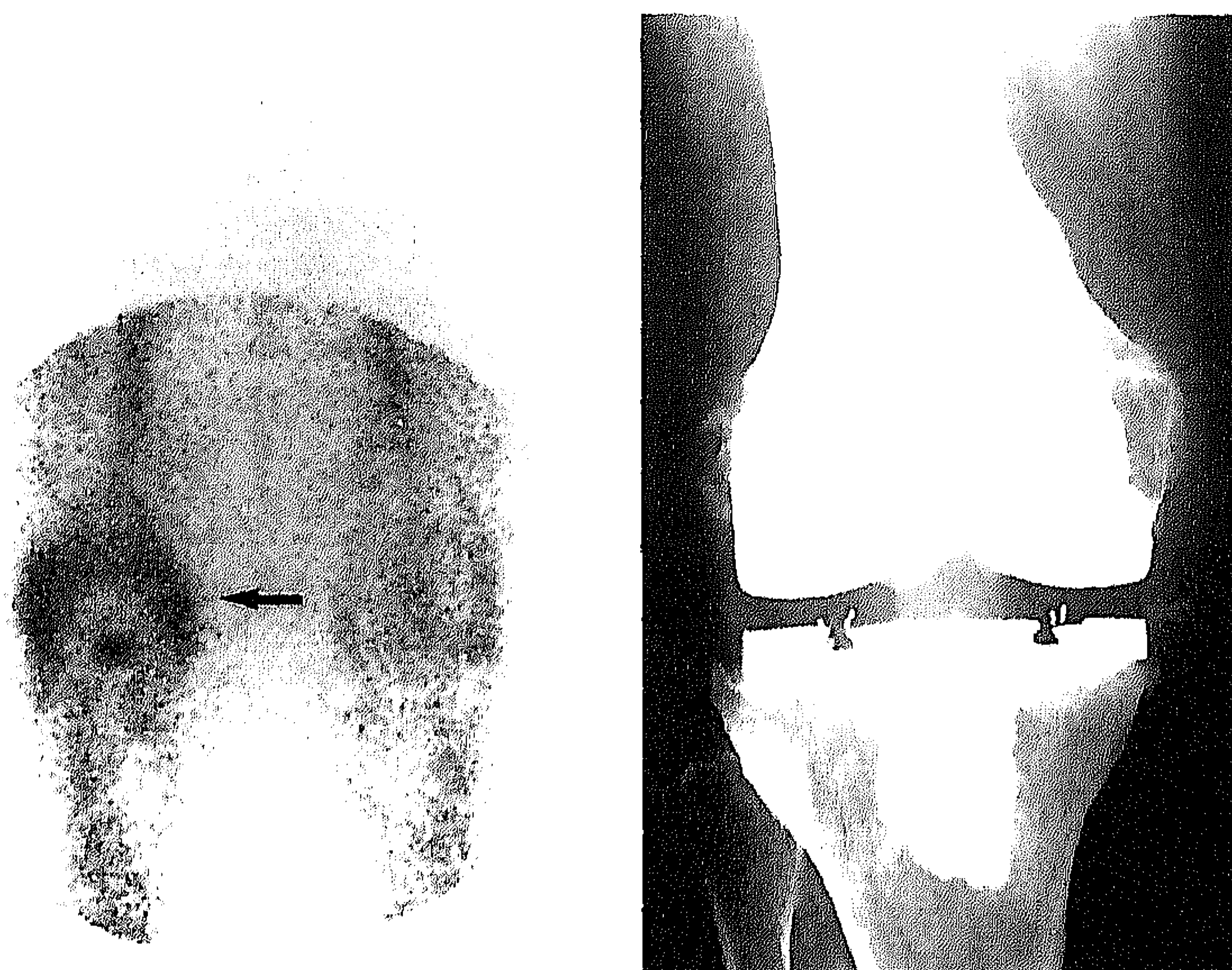
Figure 3. In-111-IgG scintigraphy of 71-year-old woman with a painful swollen right knee, 1 year after total knee arthroplasty. Puncture showed no infection. The focal accumulation of In-111-IgG (arrow) was seen to be located in soft tissues around the arthroplasty and probably caused by aseptic inflammation of soft tissues. Nevertheless, the scintigram was interpreted as false-positive for infection. No radiolucency, only some ossifications laterally in the soft tissues.