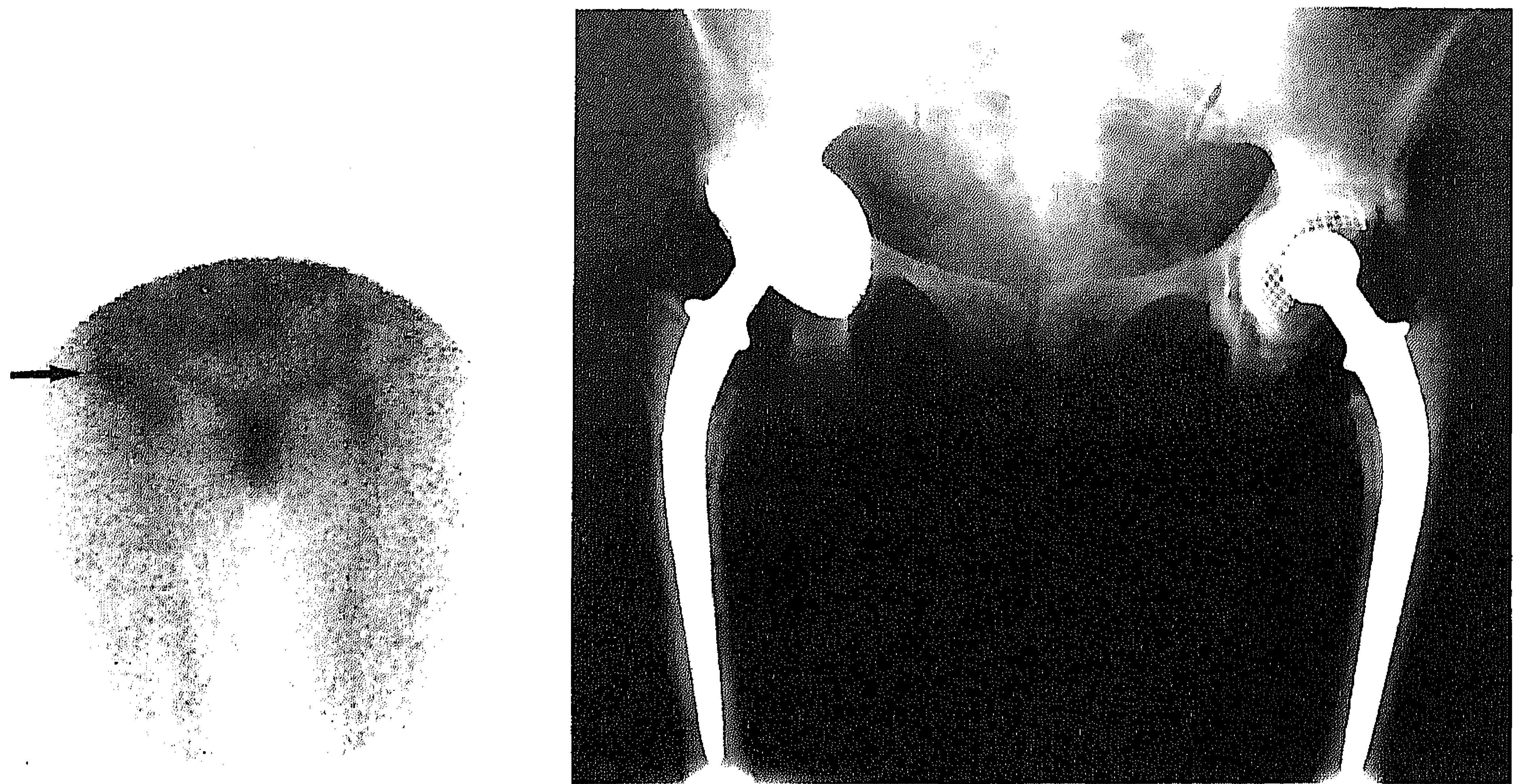
Figure 2. In-111-IgG scintigraphy of a 46-year-old woman with a cemented right total hip arthroplasty 2 years after implantation. Puncture and surgically obtained culture showed no bacteria. Focal accumulation of In-111-IgG due to aseptic inflammation (histology) is seen around the neck of the femoral component of the arthroplasty (arrow). Protrusion of the right total hip arthroplasty, radiolucent zone medial to the stem of the femoral component and periarticular ossifications.

mented arthroplasties showed a normal In-111-IgG distribution already 6 weeks after surgery. Most of the 25 In-111-IgG studies concerning patients in whom no tissue or aspiration samples for microbiological analysis were obtained were negative, while 4 were (false-) positive, due to soft tissue inflammations that were not infectious.